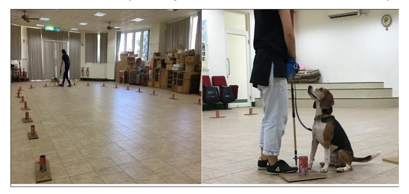
Figure 1. Dogs training. The target was randomly placed in a jar, and the dog leader brought the dog forward for detection. If there was a reaction to the target, a positive response was recorded; otherwise, a negative response was recorded. Response to non-targets was recorded as a false positive. Dogs were trained to sit down as a reaction and given a food reward if the reaction was positive.

Unmarked target (lung tumor tissue) and non-target (control) samples were randomly placed in unlabeled jars. The test was video recorded, and a technical check to ensure accurate recording was first carried out. After the target was in position, the dog leader brought out the dog for detection. If there was a reaction to the target, a positive response was recorded; otherwise, a negative response was recorded. Response to non-targets was recorded as a false positive. Dogs were trained to sit down as a reaction and were given a food reward if the reaction was positive (Figure 1). To maintain the high sensitivity of the olfactory test, the dog was trained at least twice a week for the duration of the study.