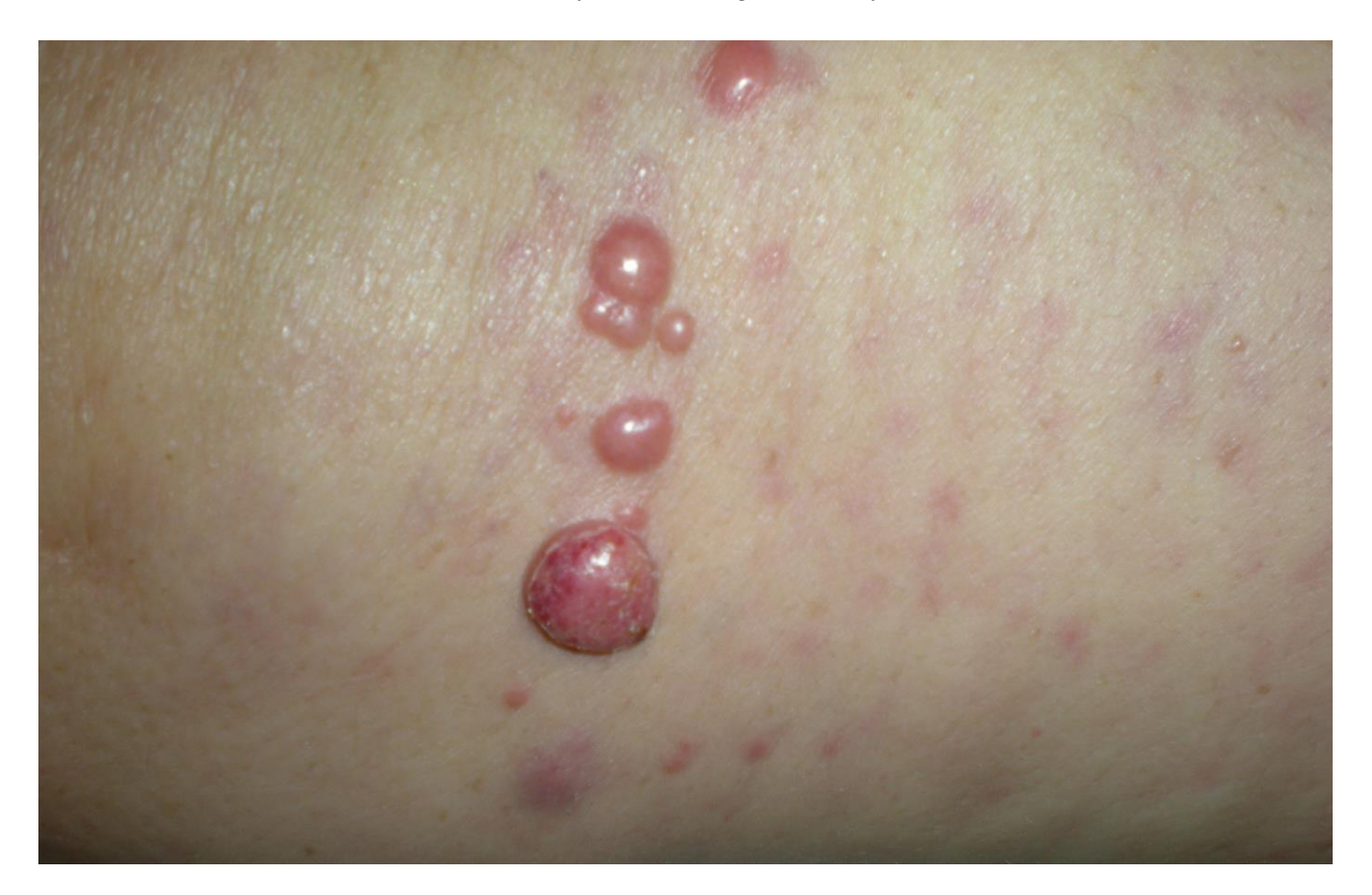
Figure 1. Locoregional metastases in a patient with MCC.

MCC usually presents as a firm, painless, nodular, or plaque-like, flesh-colored to red-violet lesion, with a high affinity for the head and neck or upper extremities (Figure 1). Rapidly growing lesions can be associated with ulceration and necrosis. Its most important features are represented by the acronym AEIOU: Asymptomatic/lack of tenderness, Expanding rapidly, Immune deficiency, age Older than 50 years, and UV exposure [9]. In a prospective study of 195 patients, the primary tumor size ranged from <1 cm in 21.3%, 1–2 cm in 43.3%, and >2 cm in 35.3% of cases [9]. The presence of nonspecific clinical features in MCC may lead to a diagnostic delay.