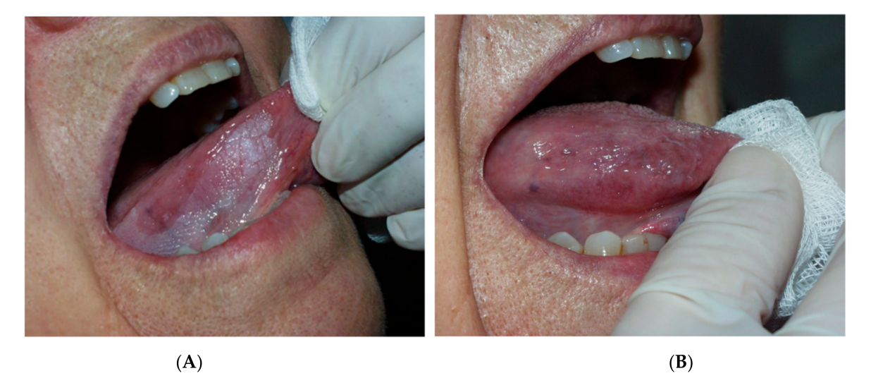
Figure 2. (A) Lesion before CO<sub>2</sub>. (B) Immediately after carbon dioxide surgery.