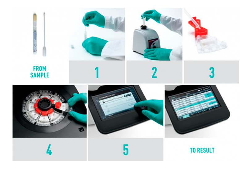
Figure 2. The workflow of the GenePOC platform.