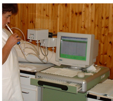
Figure 1. One of the original chemiluminescence analyzers (Logan model LR2500, Logan Research; Rochester, Kent, UK) for online measurement of exhaled NO in the early nineties. The analyzer is sensitive to NO from 1 ppb (by volume) to 5000 ppb with a resolution of 0.3 ppb. It also measures CO_2 (resolution 0.1% CO_2 ; response time, 200 ms) in real time. The subject exhales slowly (5–6 L/min) from total lung capacity for 15–20 s against resistance to exclude nasal contamination. During expiration the pressure is kept constant ( 3 \pm 0.4 mm Hg) by using a visual display of expiratory flow measured by pressure and volume sensors in the analyzer.

NO is present in trace amounts in exhaled breath [11–15,40]. Originally, highly sensitive chemiluminescence analyzers used for environmental NO detection were adapted for FeNO measurement [11,12,39] (Figure 1).