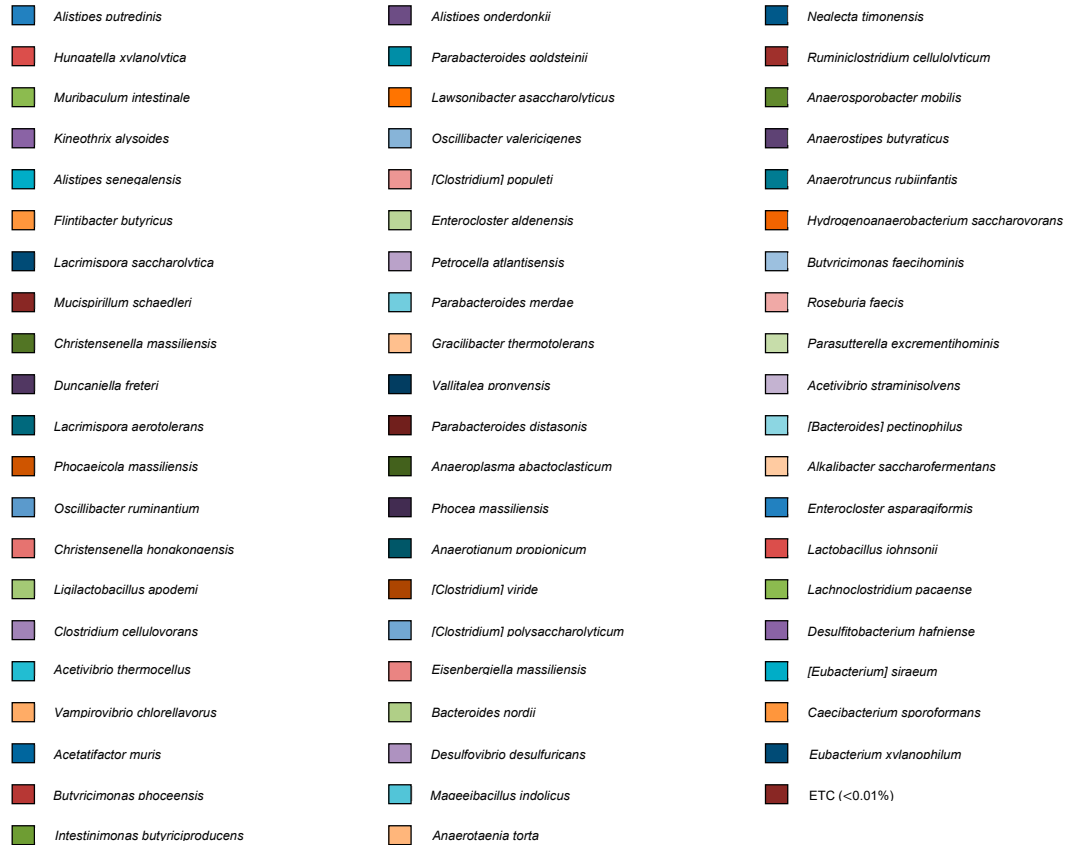
Table S1. List of commensal bacteria (species). All individual gut microbes shown in the pie chart in Figure 6D are arranged in order of their frequency here.