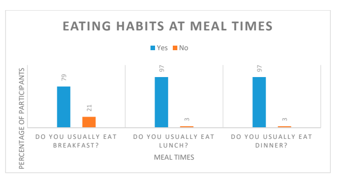
Figure 3. Eating habits at standard meal times reported by study participants.