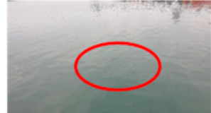
Figure S1. Reference image for DBSCAN reference mapping. The circle marked on each image were measured with a field.