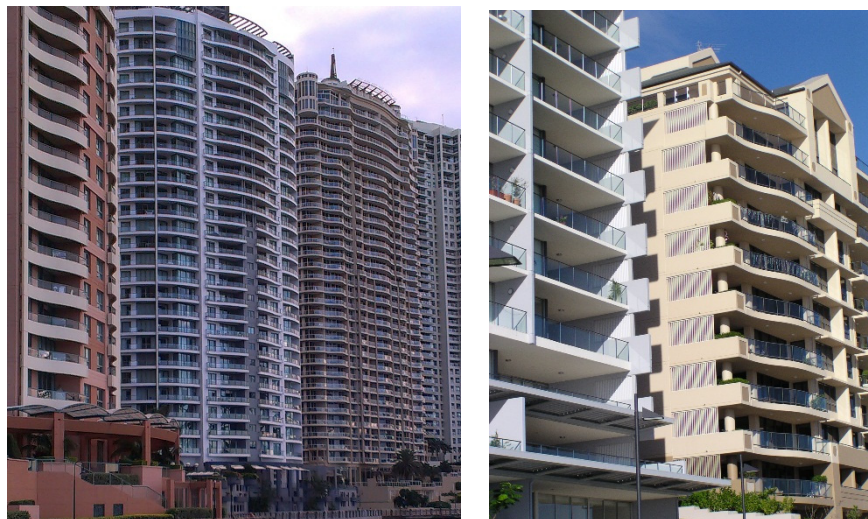
Figure 1. Multi-storey apartment buildings (MSAB) in Brisbane typically feature balconies on their facades.

breeze are sought after when these conditions prevail in summer, and sometimes on autumn and spring days. In principle, MSABs can be designed to respond to the climate, by effective use of solar orientation of buildings and external shading devices to admit or exclude direct sun when seasonally appropriate, and siting of openings to effectively generate air movement to reduce the effects of humidity in summer [16,19], yet thermal comfort for dwellings is increasingly provided by air-conditioning. Despite the advantages and disadvantages of the mild subtropical climate, the climate zone is relatively under-researched, in terms of the relationship between climate, multi-residential building design and residents' perceptions and experiences of this relationship. For example, many domestic activities are conducted in exterior private spaces such as verandas, balconies and terraces [20] and are a characteristic feature of multi-storey apartment buildings (MSABs) in subtropical cities like Brisbane (Figure 1). Residents occupying such spaces in dwellings in are potentially exposed to noise discomfort. Noise from external sources such as traffic and roof-top air-conditioning plant is prevalent in urban areas where MSAB are located. Residents using balconies may also be exposed to noise from neighbours, and may generate noise that could bother their neighbours.