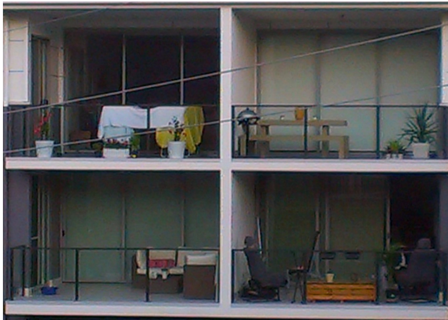
Figure 3. Glazing on balconies reveals private outdoor space and everyday domestic activities to view.

Kearney [60] found that when building orientation maximised residents' views to nature and minimised views of traffic and neighbours, negative feelings about density were reduced. However some planning codes also rely on exterior private space that overlooks streets to provide casual surveillance in the community. In many cases, this means overlooking vehicular traffic as well as pedestrian traffic. Contrary to Kearney's findings, the street side of a building may prove to be residents' preferred location for private outdoor space, rather than facing a communal courtyard. (Refer Table 2). It seems that while residents wish to be screened from others in close proximity, they also desire to relate to the broader neighbourhood and prefer a varying and activated outlook. The type of street character and volume of vehicular traffic is likely to have an effect on residential quality and tolerance of this aspect, and should be investigated in future research.