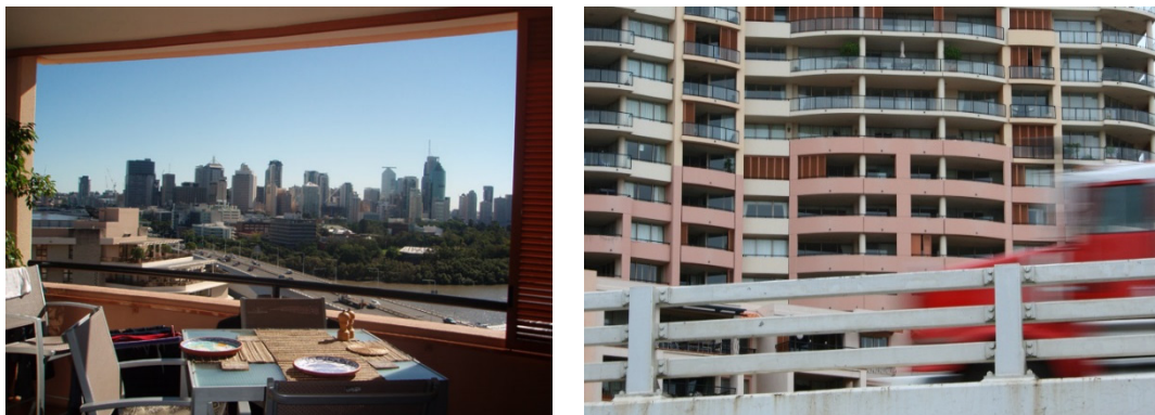
Figure 2. Balconies are valued for outdoor living and views but also provide an environmental buffer between dwelling interior and noise and dust of external urban environment.

Having a functional outdoor space for their exclusive use was considered to be an integral part of the subtropical urban lifestyle. The vast majority of residents (89%) reported that they had a balcony in their dwelling, and 87% considered the specific physical and spatial design characteristics of the balcony to be an “important” to “extremely important” influence on their experiences of spaciousness for everyday living functions, and control over privacy, and indoor environment comfort. See Figure 2.