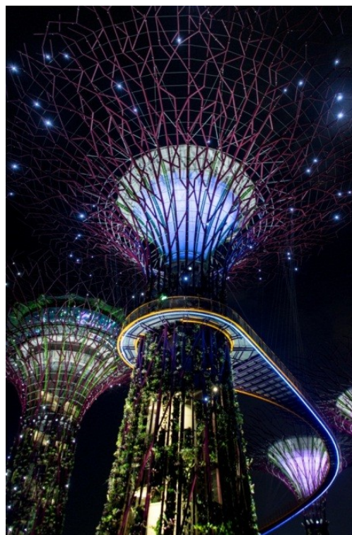
Figure 7. Photograph judged third in the 2013 staff category by Anshelm Bradford.

The winning photographs demonstrate the diversity of thinking about sustainability. The number of entries may have been small but the competition seems successful in that it achieved its aim of promoting thinking about sustainability. The annual competition is planned to continue through ACTS.