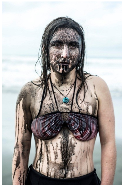
Figure 4. Photograph judged third in the 2013 student category by Matthew Goodman.

The photographer noted his intention for the photo to present the message with few words to explain it as was requested by the competition guidelines. Other competition photographs seemed to rely on the words of the accompanying caption and also the short explanation of how the photograph suits the theme of sustainability that were both requested as part of the entry. This request may have led potential entrants to believe that judges would take these explanations into account when appraising the alignment of the photograph to the theme of sustainability. It is suggested that it be written clearly that the judges evaluate how the photograph conveys the theme of sustainability and they do not read the caption or explanation.