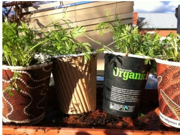
Figure 2. Winning photograph in the 2013 student category by Rebecca Taylor.

In 2013, Saba Nabi, a mother of a four year old toddler from Charles Sturt University submitted the entry that came second in the student category titled Lone survivor—let's change their destiny is shown in Figure 3. Saba commented that she entered because she wants the best for her daughter. She described her photograph: “We had an immense collection of birds which beautified our land but deforestation has now been the real culprit for destroying vast areas of migratory bird habitat. ...We need to preserve these lone survivors”. Both the title and this caption alludes to a view that sustainability is represented by large numbers of wild birds but this species of bird is not normally found in a flock but rather it is often solitary. She further commented that as a child she used to see groups of birds sitting together enjoying each other’s company but now it’s common to see a lonely bird everywhere. As a mother she is thoughtful of the world that her child will inherit.