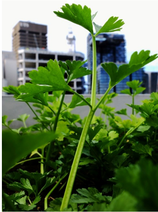
Figure 5. Winning photograph in the 2013 staff category by Simona Galimberti

It is relevant that environmental sciences students value photography and also to notice that high rise of Sydney is in the background and a focus.