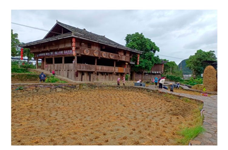
Figure 2. Restored stilted building in the Mengwu Miao Scenic Spot.

Mengwu Miao is a scenic tourism destination with 36 relocated households. In 2017, the stilted buildings in previous sites were dismantled, numbered, packed, and shipped to this scenic tourism destination, where they were thoroughly restored (see Figure 2). The original owners were allowed to continue living in their restored homes. Later, a few replica buildings, incorporating cultural elements of ethnic Miao, were built alongside the old houses to form a particular tourism neighborhood featuring homestay accommodation, unique dishes, and ethnic handicrafts (see Figure 3). At present, resettled residents work in scenic spots during the daytime and live in the restored stilted buildings at night. Living in their workplace or working near home means that they fulfill their desire for employment at home. In addition, tourism development brings an increase in visitors to Mengmu Miao Village, driving the growth of visits to circumjacent rural and agricultural tourism sites and farmhouses. According to relevant statistical data, after Mengmu Miao Village was put to use, the tourist flow of farmhouses within a radius of 2 km increased significantly, from 1000 per day to more than 4500. As a representative of the innovative combination of PAR and tourism development, Mengmu Miao Village allows for sharing the fruits of tourism development among surrounding villagers and resettled residents.