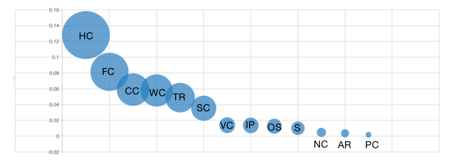
Figure 6. The sequence of 13 secondary indicators in weighted value. Note: human capital (HC); financial capital (FC); cultural capital (CC); work capacity dependence (WC); tourism resource dependence (TR); social capital (SC); vulnerability context (VC); institutional process (IP); organizational structure (OS); subsidy dependence (S); natural capital (NC); agricultural resource dependence (AR); physical capital (PC).

Firstly, the weighted value of the livelihood capital is 0.3105, indicating a median level, among which human capital (0.1281) is the most important part of livelihood capital. However, the low value of education level (0.0295) and training opportunities (0.0113) demonstrate low literacy levels and human-capital skills among resettled residents which need improvement. The weighted financial capital is 0.0815, second only to human capital in its contribution to livelihood capital. Under financial capital, annual household income ranks second among all livelihood-capital indicators, proving that relocating to tourism areas boosts household income and expands household-income channels, making livelihoods more diversified. The weighted value of cultural capital is 0.0590, making the third-largest contribution to livelihood capital, indicating the importance of cultural