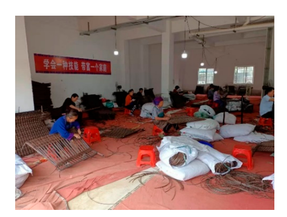
Figure 4. Woven rattan chairs sold as tourism commodities in Miaomei Homeland.

Miaomei Homeland, located in the west of Rongshui County within the scenic areas of Shuanglonggou and Mengwu Miao, was established in 2019; it houses 4793 relocated people in 1225 households. Tourism employment opportunities are provided to left-behind women and unfit/older laborers from over 400 relocated households, including workshops in rattan-chair weaving, garment marking, community welfare, and tour-guiding (see Figure 4). Younger laborers are sent out by the community employment agency or given flexible local jobs locally. Miaomei Homeland community is only about 500 m away from the Shuanglonggou Scenic Spot and is the only access to enter the spot. To fully utilize its geographical advantages, the community has established the "Miashan Revitalizing" cooperative of agricultural products and created its own brand in workshops and supermarkets. By selling products to tourists, resettled residents enjoy stable employment and income. Moreover, their shops also provide a platform for agricultural products produced by other cooperatives and communities within the county.