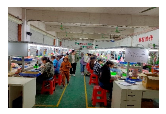
Figure 5. Poverty alleviation workshop in Miaojia Town.