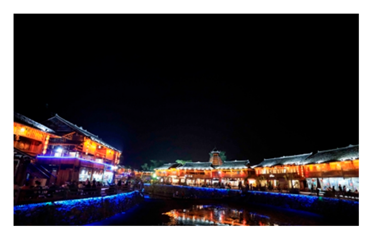
Figure 3. Culture Street in the Mengwu Miao Scenic Spot.

Miaomei Homeland, located in the west of Rongshui County within the scenic areas of Shuanglonggou and Mengwu Miao, was established in 2019; it houses 4793 relocated people in 1225 households. Tourism employment opportunities are provided to left-behind women and unfit/older laborers from over 400 relocated households, including workshops in rattan-chair weaving, garment marking, community welfare, and tour-guiding (see Figure 4). Younger laborers are sent out by the community employment agency or given flexible local jobs locally. Miaomei Homeland community is only about 500 m away from the Shuanglonggou Scenic Spot and is the only access to enter the spot. To fully utilize its geographical advantages, the community has established the "Miashan Revitalizing" cooperative of agricultural products and created its own brand in workshops and supermarkets. By selling products to tourists, resettled residents enjoy stable employment and income. Moreover, their shops also provide a platform for agricultural products produced by other cooperatives and communities within the county.