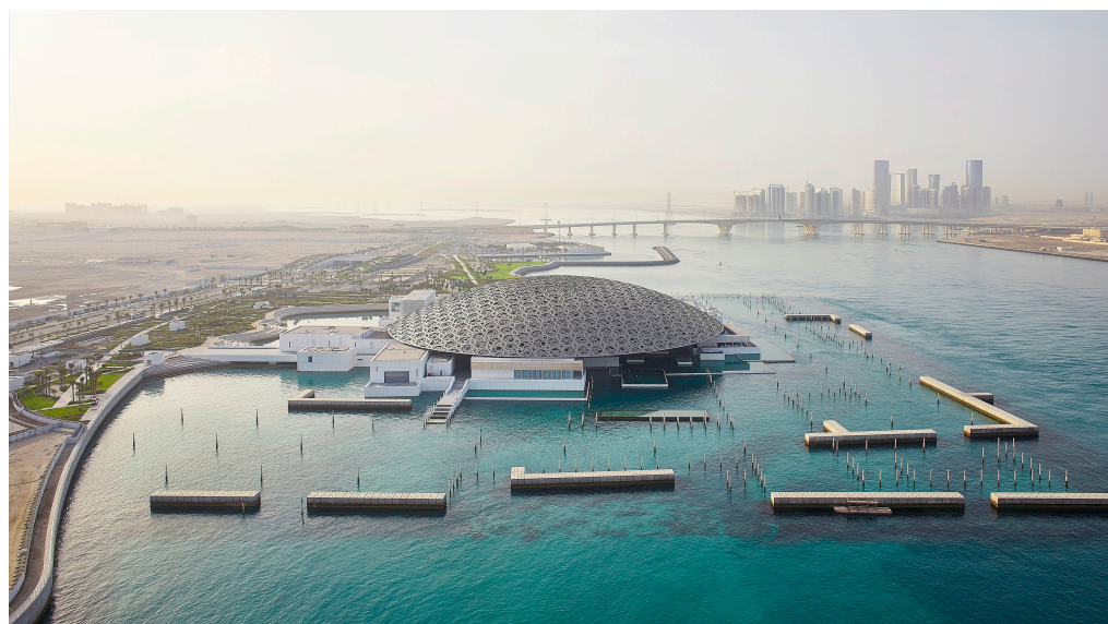
Figure 1. Louvre Abu Dhabi on Saadiyat Island.