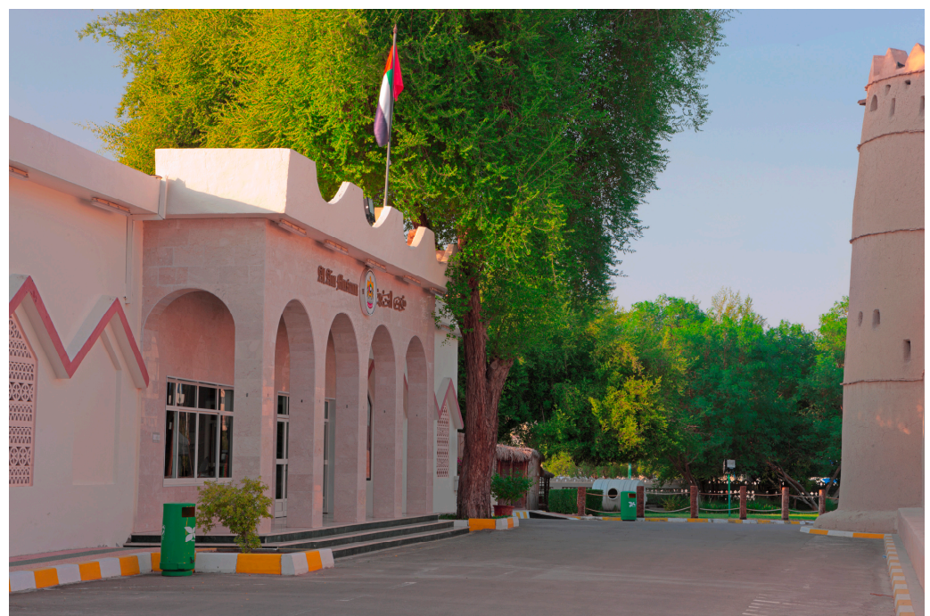
Figure 3. Al Ain National Museum.