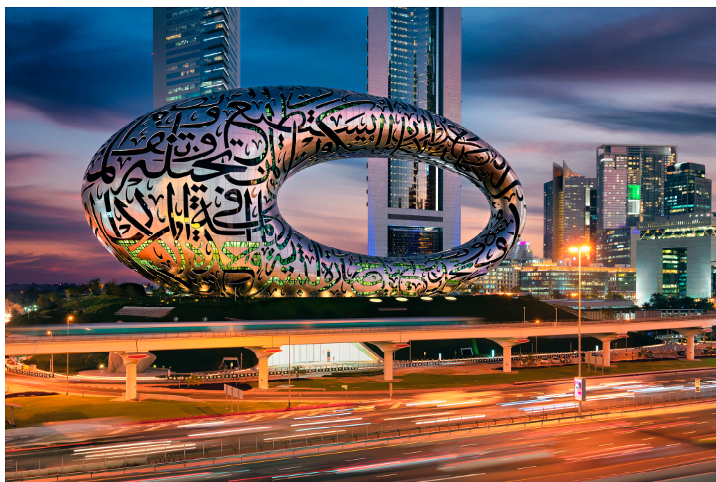
Figure 2. Museum of the Future.

and other traditional public buildings [52], as a vital element of the UNESCO-classified Cultural Sites, inscribed on the World Heritage list. Its implantation, adjacent to the Sultan fort and the main oasis, needs, therefore, to be perceived in the context of longstanding settlement dynamics, additionally confirmed by a recent archaeological excavation at the museum car park [53]. The entire complex is currently undergoing a major rehabilitation, for which the museum is temporarily closed, and the resulting makeover is to retain the physicality of the area, as one of the representational nodes of settlement, directly tied to the ruling family of Abu Dhabi, and thus to the formation of the United Arab Emirates. The renovation could even be optimized as a part of the narrative on architectural sustainability, by furthering the message of historical site continuity. Effectively communicating this heritage uniqueness has been achieved through the integrated channels of the emirate's Department of Culture and Tourism, mentioned above. It closely associates with a much wider exertion, positioning the city of Al Ain in a clear-cut tourism landscape through the creation of a brand identity [54].