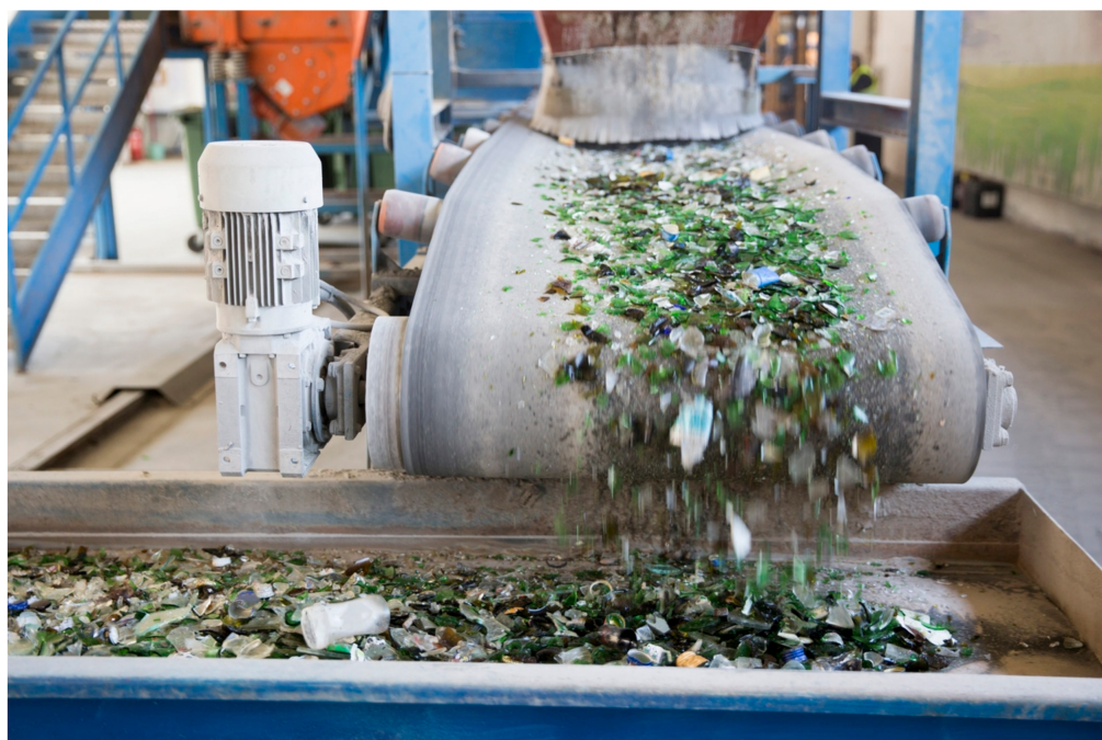
Figure 5. Glass recycling process.