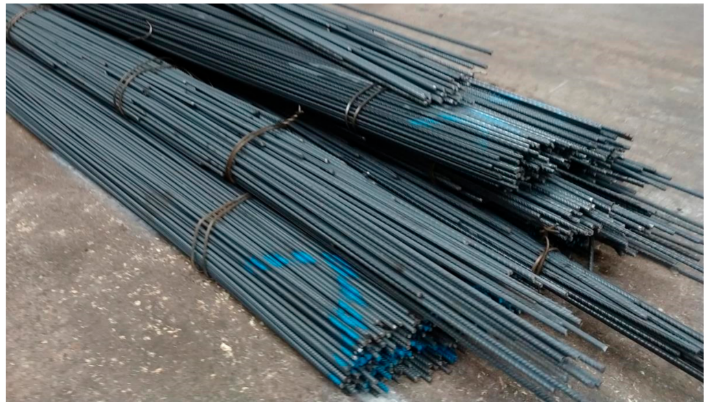
Figure 7. Reinforcing bars made of recycled metal.

Metals have a high potential for re-use in the construction industry. The first group, which is most obvious, comprises steel elements, which are used repeatedly in the construction of buildings, such as excavation protection elements, i.e., sheet piling elements, scaffolding, and site infrastructure, usually in the form of steel building containers. Similar features are seen in structures designed to be converted or relocated, such as marquee building systems, most often in the form of halls erected as temporary structures. Such buildings are simple to erect, durable, and, most importantly, can be converted or relocated for a new function. For these conditions to be met, such buildings must be made of simple elements that are durable, and easy to assemble and transport. Today, only steel elements can meet these requirements. Columns, steel girders and truss elements have the same function. These structures can be successfully used for newly erected buildings. This can be done either by relocating the entire structural system or by adapting these elements for new construction [93].