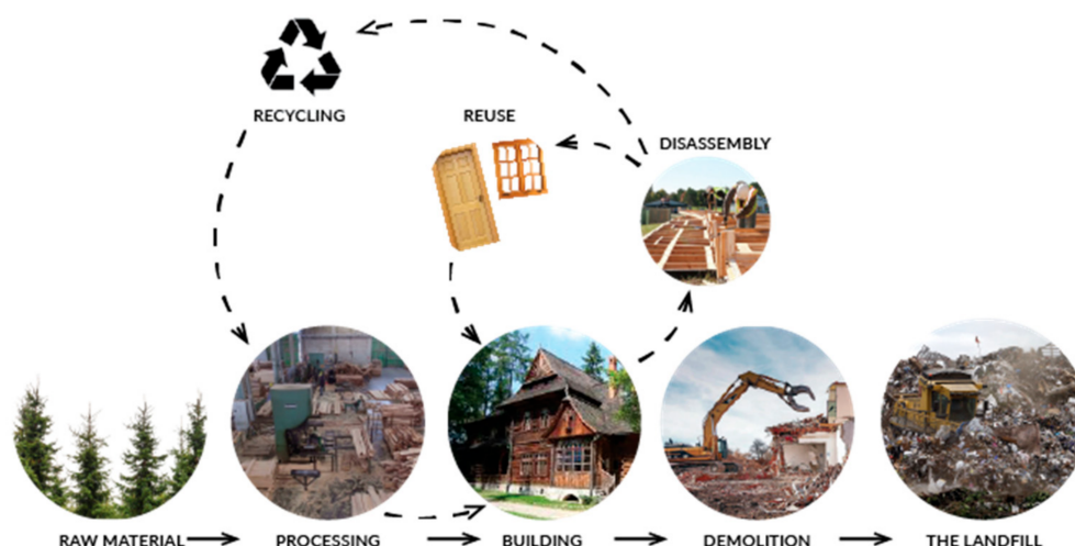
Figure 2. The process of using recycled wood in the construction technology.

Wood material deposited in landfills represents significant potential for closed-loop reuse in the construction industry [28]. Its main sources are in the construction sector, municipal solid waste, and the wood processing industry (Figure 2). The construction industry generates a huge amount of wood construction waste resulting from (i) new constructions, (ii) the renovation and upgrading of existing stocks, and (iii) building demolition [37]. According to the Construction and Demolition Recycling Association (CDRA), wood accounts for at least 20–30% of all construction and demolition waste (CDW) [38]. The proportion of CDW wood waste varies according to the country of generation. It is estimated to be 26.7% in Germany [38], 10–16% in Brazil [39], and 6–7% in the United States [40].