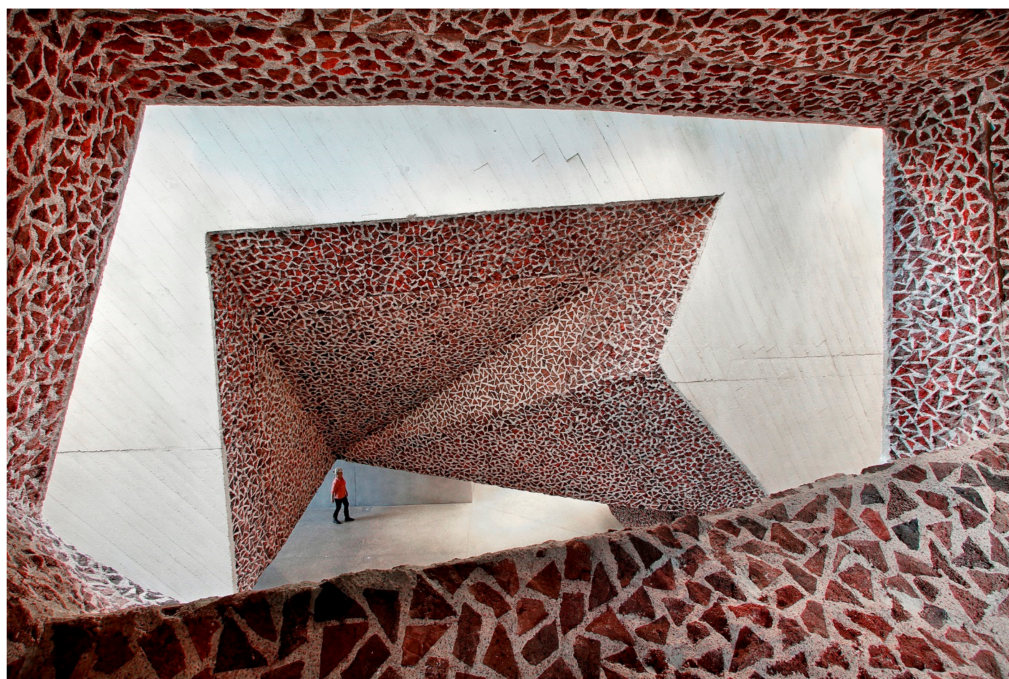
Figure 6. An example of using recycled ceramics in a building.