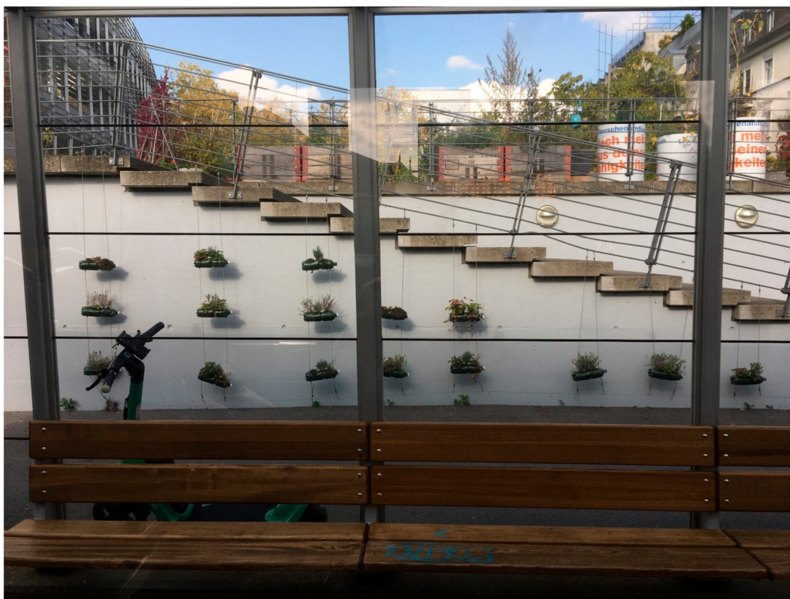
Figure 3. PET bottles used as flowerpots in a public space in Zurich.

the same time, they emphasize the energy efficiency associated with heat retention inside the buildings [54] (Figure 3).