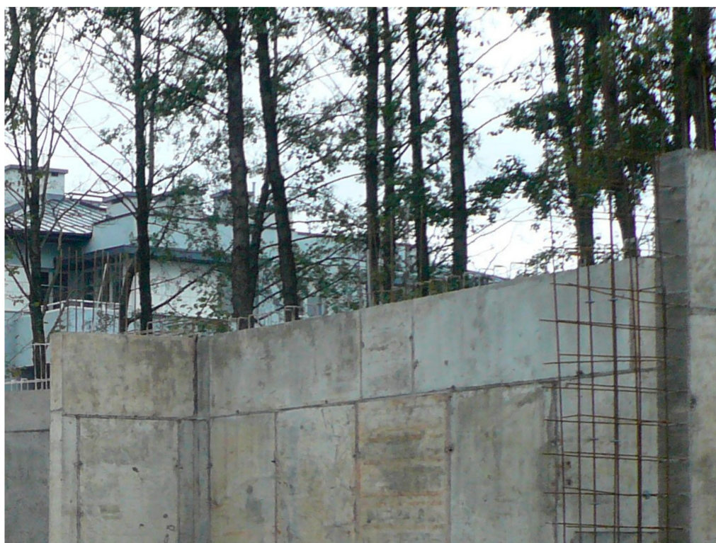
Figure 4. Recycled concrete—construction of a multi-family house, designer A. Starzyk.

Recycling reduces the consumption of raw materials for the production of concrete, minimizes waste, and reduces water consumption by up to 30%, which translates into investment returns.