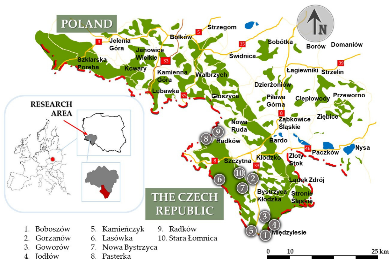
Figure 1. Location of sites selected for detailed analysis.

Ten sites located in Kłodzko Land were selected for detailed analyses. Nine of them are located within Kłodzko County and one within Kamienna Góra County. During field research, attention was paid to the location of sites and their role in the landscape. An inventory of the most historically significant architectural elements affecting attractiveness was also made. The information collected in the field was supplemented by desk research, during which the focus was on the analysis of data related to the history of the origin of sites (cemeteries and churches), tracing changes in the formation of the architectural style of churches, as well as identifying the special features of sites affecting the richness and diversity of sites. A detailed summary of the collected data is provided in the tables (Figure 1 and Table 2).