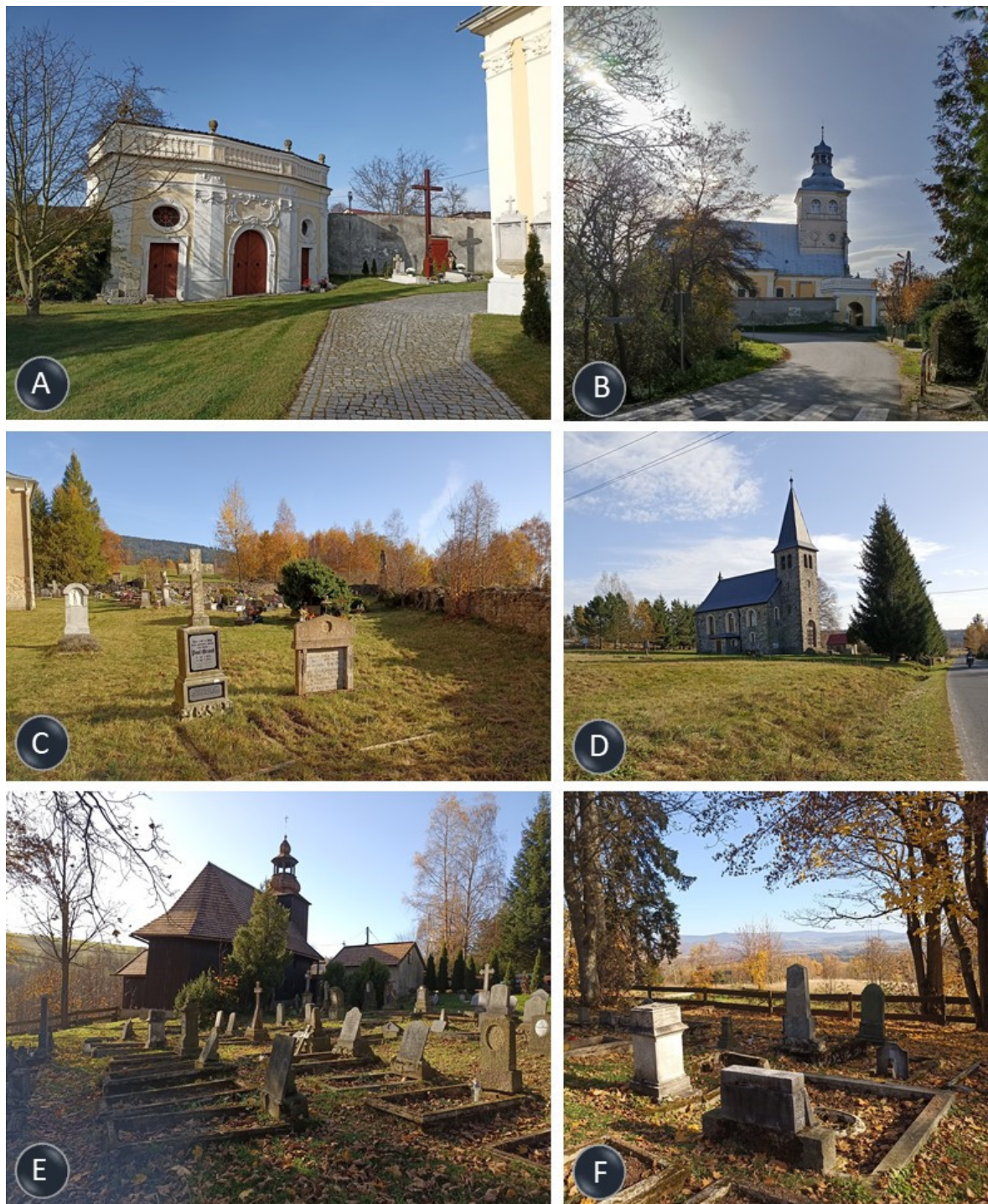
Figure 2. Distinctive landscape elements of the analyzed sites: (A) Baroque chapel in the cemetery in Gorzanów; (B) the church in Gorzanów; (C) historic tombstones in the cemetery in Jodłowo; (D) neo-Romanesque church in Lasówka; (E) wooden Baroque church in Kamieńczyk; (F) view of historic tombstones and the viewpoint from the cemetery in Kamieńczyk.