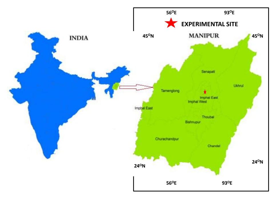
Figure 1. Location of the study area.

and the average annual rainfall is 1212 mm. The soil falls under the inceptisols order and is clayed in texture ( hyperthermic aerichaplaquept according to U.S. soil taxonomy), acidic in reaction (pH 5.24), medium in available N (287.34 N kg/ha), available phosphorus (16.0 P_2O_5 kg/ha), available potassium (218.0 K_2O kg/ha) and organic carbon (1.4%).