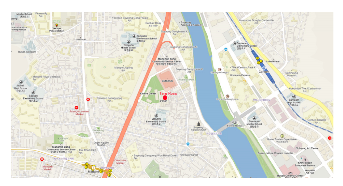
Figure 14. Location of Terarosa.

Later, when the Busan Biennale was held in 2016, a proposal was made to reuse this neglected facility through an agreement between the public and private sectors to create a new cultural complex. The cafe has become a representative tourist attraction since 2016 and attracts several tourists owing to its proximity to Suyeong Historical Park and BEXCO, which are located within 2 km, and Haeundae and Gwangan Bridge, which are located within 5 km (Figure 14).