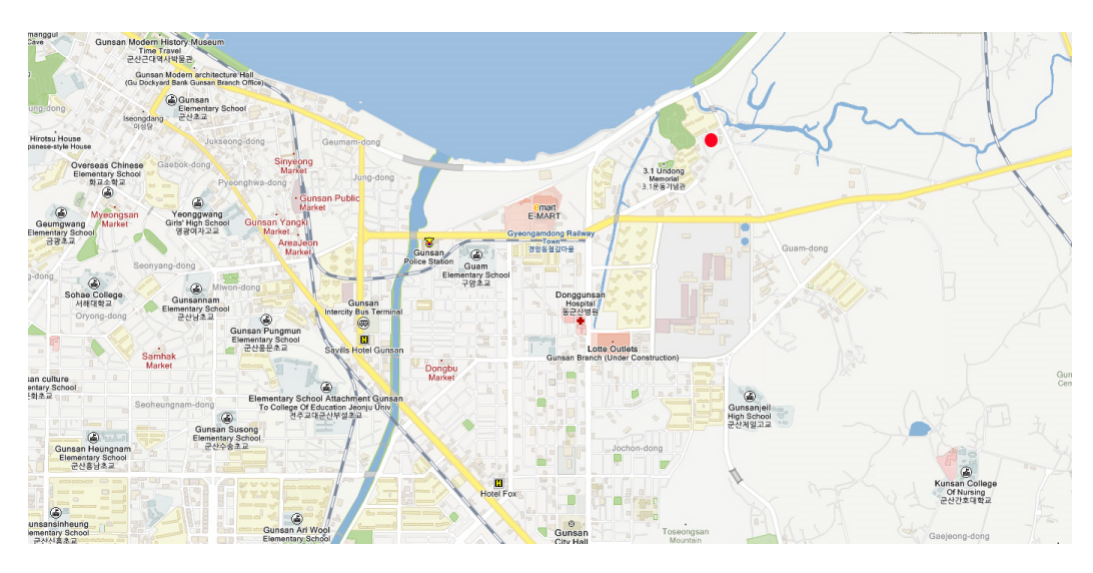
Figure 18. Location of Migok storage.

Migok Storage was constructed in 1976 as a rice storage warehouse. This area was an agricultural production area far from the city center, and the warehouse was built to store rice harvested from neighboring farmlands or to control rice yield. However, the utilization of this facility rapidly declined since the 1990s when the rice market was opened up by national policy [27] (Figure 18).