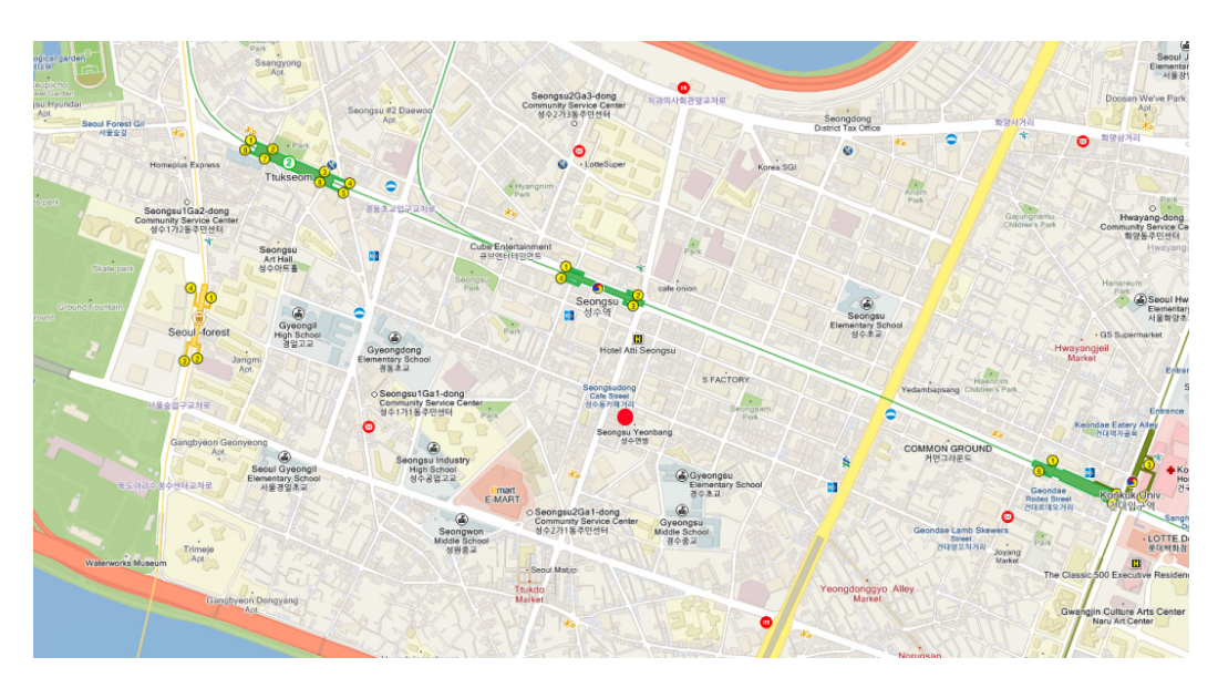
Figure 6. Location of Daelim-Changgo.