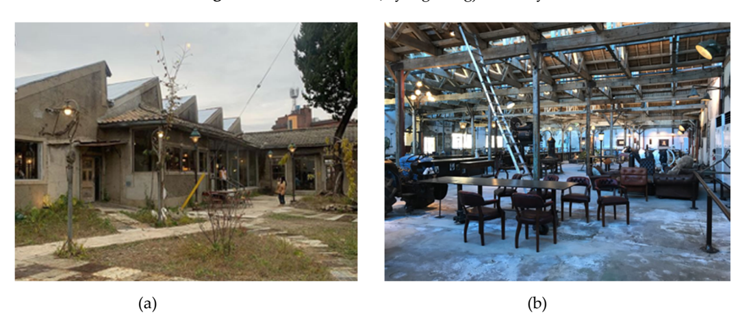
Figure 3. Appearance of Joyang-Bangjik. (a) Exterior; (b) Interior.