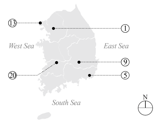
Figure 1. Site map of regenerative cafes in South Korea, examined in detail.

In addition to describing the cafés in terms of ambience and infrastructure, we describe the manner in which the people react and feel about the architectural elements in the spaces of the said cafés.