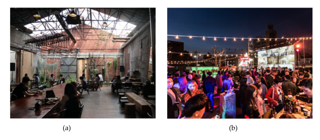
Figure 9. Activities in Daelim-Changgo. (a) Indoor; (b) Outdoor.

The cafe increases the time spent by consumers inside with a varied selection of activities such as dining, galleries, experiences, and resting spaces in each floor while centering on the cafe. Moreover, it is recognized as a non-everyday space in the city center by emphasizing the storytelling aspect of the building by placing a courtyard that communicates with the external environment inside the building to attract natural light (Figure 9).