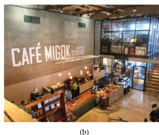
Figure 19. Appearance of Migok Storage. (a) Exterior; (b) Interior.

The appearance of the cafe is similar to other existing facilities due to the use of primary colors. Only glass windows were added for visual opening and lighting, but the wooden triangle trusses and upper ventilation windows were maintained. The concrete floor was only epoxy-coated, thereby maintaining the feeling of original materials. Moreover, the cement mortar of the inner wall and some brick finishes were kept. Both sides of the single space in the cafe are flanked by purpose-built rooms such as a roasting room, bakery, meeting room, and gallery (Figure 20a).