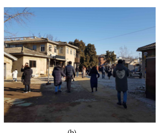
Figure 5. Activities in Joyang-Bangjik. (a) Indoor; (b) Outdoor.