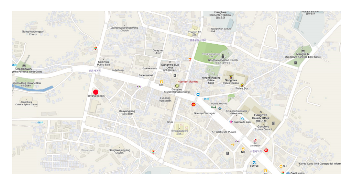
Figure 2. Location of the Joyang-Bangjik factory.