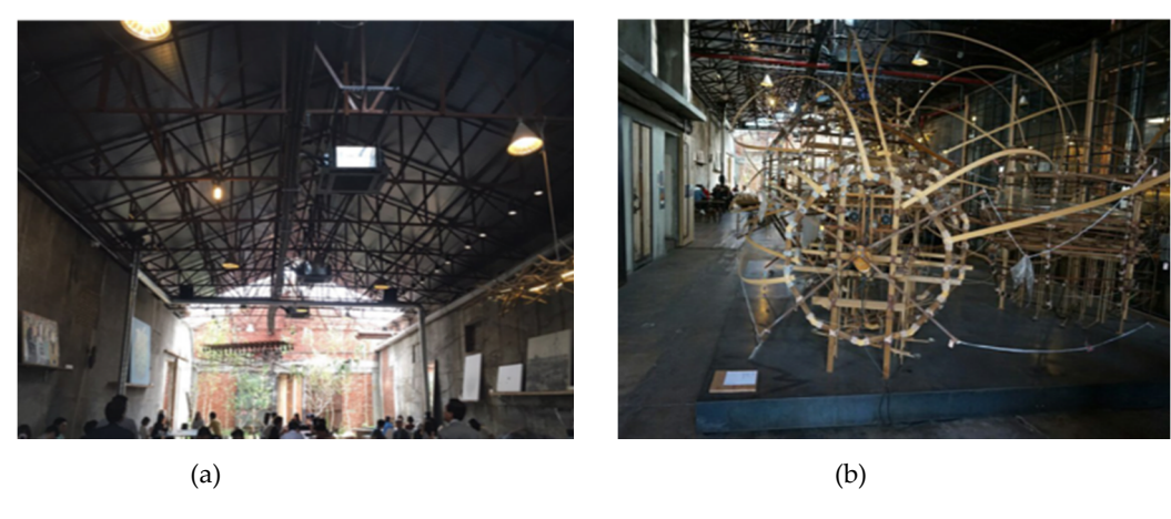
Figure 8. Spatial composition of Daelim-Changgo. (a) Roof Structure; (b) Exhibits.

interior space and uses a variety of spaces on each floor to form a three-dimensional structure centered on a single space (Figure 8b). Even though access is somewhat inconvenient because there is no separate parking lot, it is conveniently accessed by public transportation (Seongsu subway station and buses).