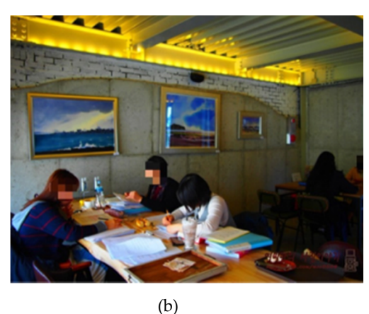
Figure 21. Activities in Migok Storage. (a) Indoor I; (b) Indoor II.