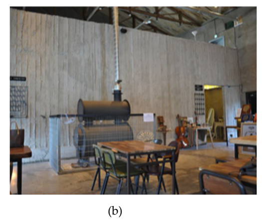
Figure 20. Spatial composition of Migok Storage. (a) Roof Structure; (b) Exhibits.