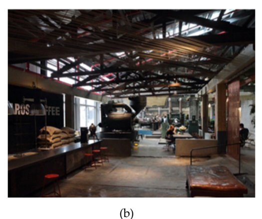
Figure 15. Appearance of Terarosa. (a) Exterior; (b) Interior.