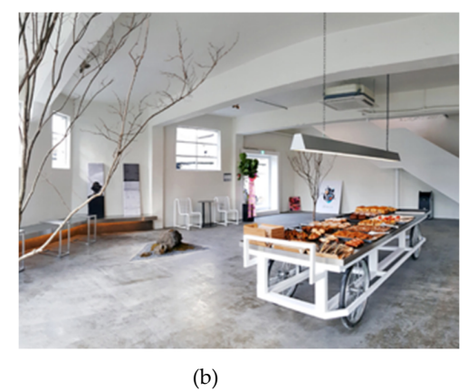
Figure 12. Spatial composition of Billy Works. (a) Roof Structure; (b) Exhibits.