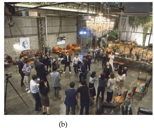
Figure 13. Activities in Billy Works. (a) Indoor I; (b) Indoor II.