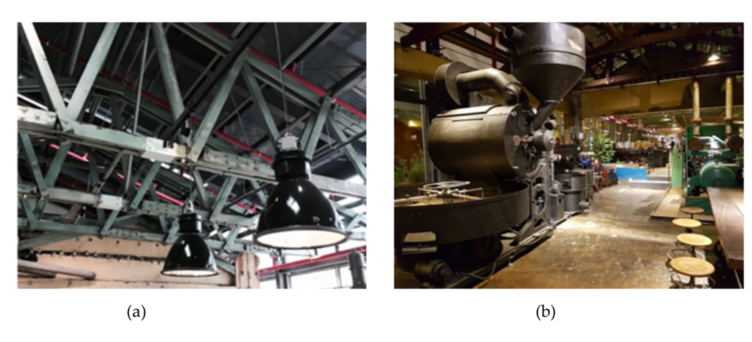
Figure 16. Spatial composition of Terarosa. (a) Roof Structure; (b) Exhibits.

The cafe functions as a cultural complex because it offers various programs and activities with galleries, libraries, and a horticultural space coexisting with the large external space. Furthermore, this regenerative cafe is similar to the Joyang-Bangjik Café, which stages various programs with an indoor space connected to the external space. It is located in a more densely populated downtown area than Joyang-Bangjik Cafe, which requires access by car. Thus, it has the advantage of convenient access by public transportation such as subways and buses.