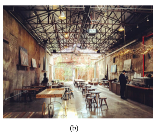
Figure 7. Appearance of Daelim-Changgo. (a) Exterior; (b) Interior.

In particular, the interior of the first floor largely consists of two parts. One part is a cafe area where the rough finishing of the reinforced concrete columns and beams, the inner walls made of cement mortar and bricks, and the concrete floors were maintained. The second part is mainly a restaurant area using existing bricks painted in white and wooden flooring, which provide visual contrast (Figure 8a).