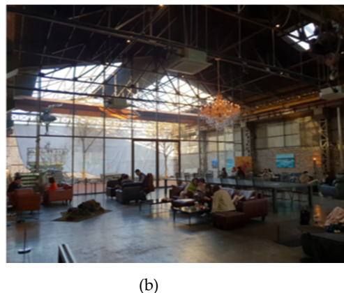
Figure 11. Appearance of Billy Works. (a) Exterior; (b) Interior.