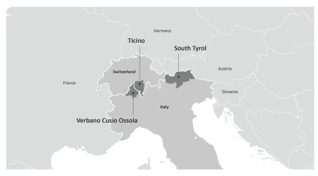
Figure 2. Map of study areas highlighting the three regions examined in this study.

The three study areas selected for this work are shown in Figure 2: Canton Ticino in Switzerland, the autonomous province of South Tyrol (Italy), and the Italian province of Verbania-Cusio-Ossola. Canton Ticino is the southernmost canton of Switzerland, being the only Swiss canton completely located to the south of the Alps. In 2014, Canton Ticino was voted the most ecologic canton in Switzerland [45]. In 2018, 53% of energy consumption in Ticino was met using energy from renewable sources. In 2020, Canton Ticino won the Swiss prize "Goldenen Stecker 2019" that recognized the active commitment of the canton in favoring electromobility [26]. Additionally, the EV fleet figures (see Table 2) confirm the role of Ticino as a lead region.