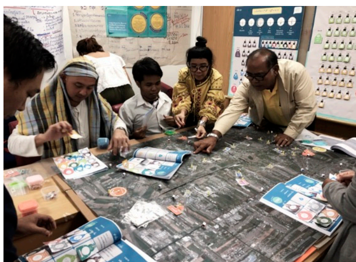
Figure 3. Placing reference points and community collective assets onto the map in the second stage.

Finally, the third stage encourages players to consider the different strategies or systematic coping measures for different types of risks, based on the collective assets of the community. Using the threats and assets cards from the previous stage, the participants must collectively identify the resources that are at risk and reflect on how these risks could be mitigated. The use of crisis planning diagram is introduced at the beginning of the last stage. Figure 3 shows the circle diagram consisting of three relational rings for planning possible crisis mitigation solutions. At the middle of the diagram, the chosen crisis event card from the previous stage is placed. Then, all participants are requested to discuss what community assets would be affected and at risk. Therefore, they would place their asset cards onto the middle ring. When realizing impacts of possible risks and threats from the crisis on their community assets and lives, participants are then requested to discuss and find possible plans, solutions, and helps to mitigate these impacts. Here, the role of facilitator is important to encourage all participants to contribute and to help guide the discussion in a productive direction. After the strategic plan has been completed, a de-briefing session is held to allow participants to reflect on the issues discussed and to provide feedback on the process of using the toolkit (see Figure 4).