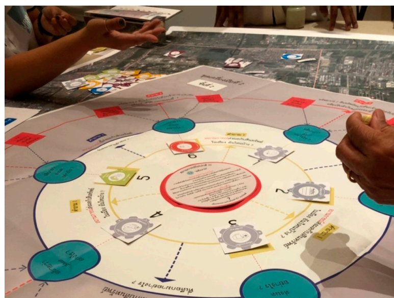
Figure 4. The crisis planning diagram used at the last stage of the toolkit.

The strategic plan made by the community should be shared with the local municipal authorities, possibly with further revisions, or to be used for communicating with government agencies about how the community can become more resilient. This is especially pertinent to when the risks faced by the community can be mitigated only through municipal interventions such as the improvement of canal embankments or infrastructural repairs. The strategic plan produced through the ‘Kin Dee You Dee’ toolkit may also be a guiding document for community action or a starting point for a more detailed community resilience strategy; many elements of the strategic plan may be implemented by the community themselves, such as promoting waste and greywater recycling, formation of working groups, or providing specific support to particularly vulnerable members of the community.