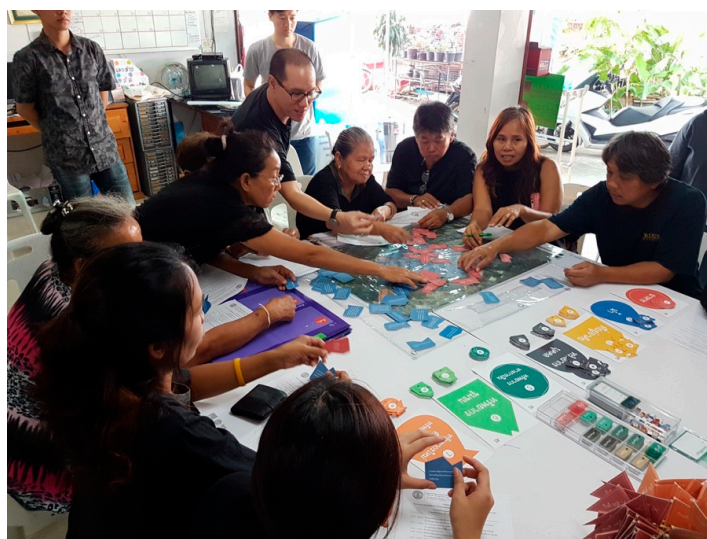
Figure 2. A matching key terminologies and definitions game in the first stage of Kin Din You Dee toolkit.