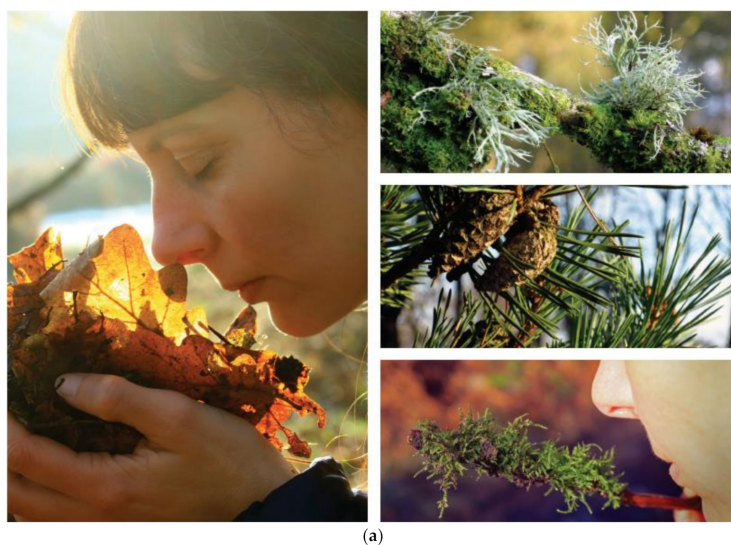
Figure 1. Cont.