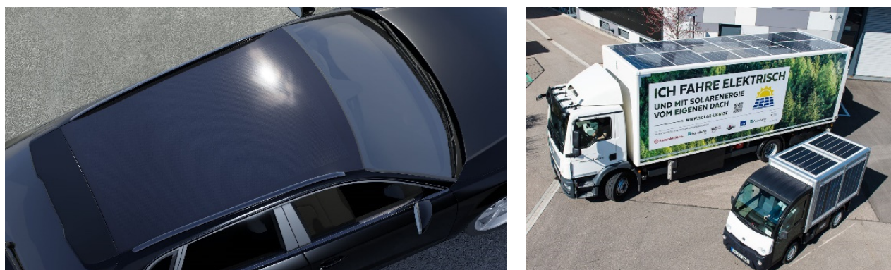
Figure 1. Solar roof design for cars built at Fraunhofer ISE (left), and concept truck equipped with VIPV modules on the roof (right).

New designs of planar conventional PV modules must be certified according to the safety requirements defined in IEC 61730-2:2016 [12,13] and IEC 61215-2:2021 [14,15], prior to market release. On the automotive side, vehicle components have to fulfill requirements according to a number of standards to ensure safety during vehicle operation. In the case of VIPV modules, each of the required tests on both sides must be passed independently to verify safe operation on the module level as well as on the vehicle level. After ensuring comprehensive component safety by passing all required tests from the mentioned standards, the new design can be applied to the homologation process guided by the road authority of the respective country. The requirements for a vehicle or component to be homologated for roadworthiness are defined in part (13) of directive 2009/661/EC [16]. Since the changes applied to the vehicle in the case of VIPV modules are limited to “the vehicle exterior and accessories”, the respective IEC standards for PV and ISO as well as the ECE standards that apply for these exterior elements are relevant. In Table 1 we collected the relevant standards, which may be applicable for VIPV modules.