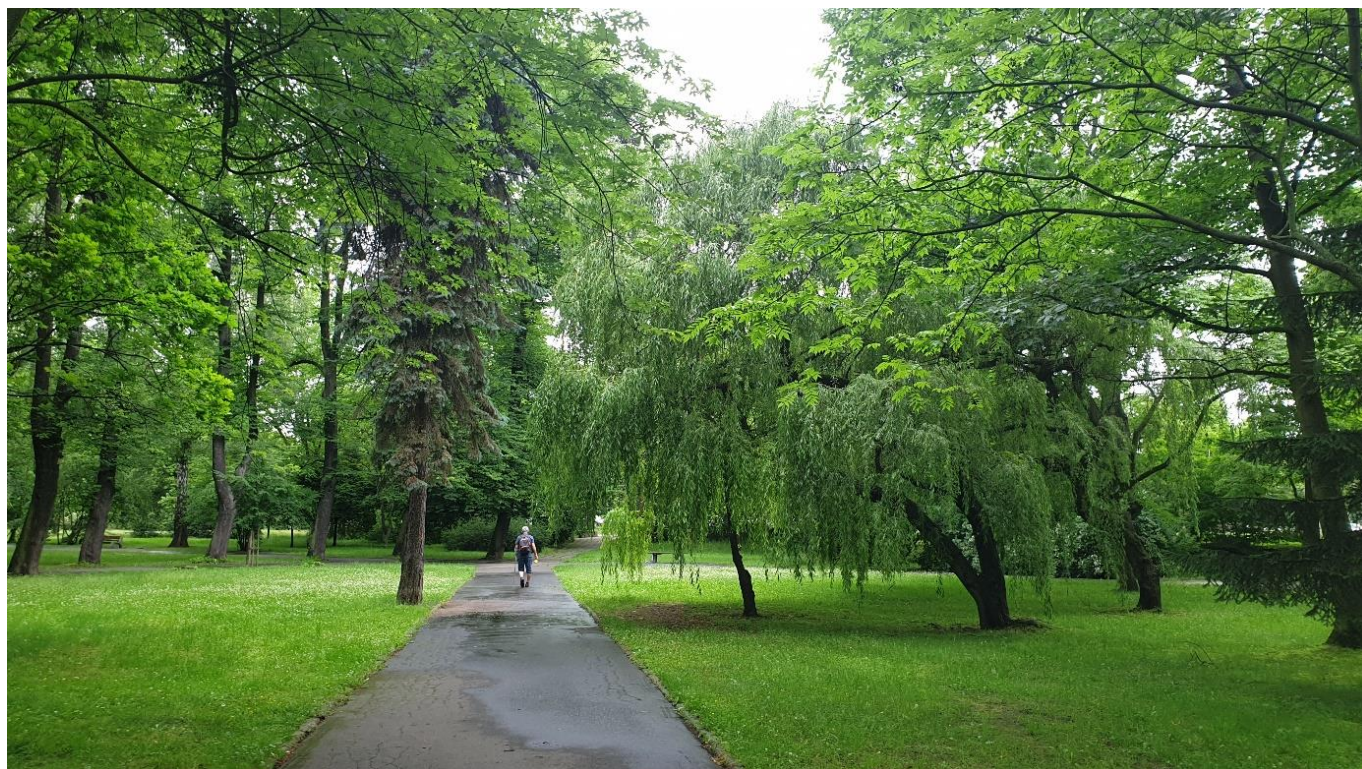
Figure 1. A park in the vicinity of the Gdańsk University of Technology occupying a former cemetery site.

After cemetery decommissioning, the diversity of plant species may decrease, mainly those planted individually at the graves [13], even if research indicates that the most popular woody plant in cemeteries is the common thuja [40]. For example, in Gdansk, only larger trees are left in the parks occupying former cemetery sites, planted along the main avenues of the necropolis (Figure 1).