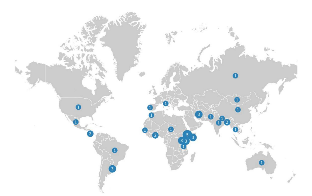
Figure 2. Geographical spread of study areas in selected papers. Dots are placed in the center of the country where the study took place. The numbers indicate the number of papers addressing (an area within) a country, also visualized through larger dot sizes.

Four categories of quantification methods were found, with one paper not fitting any of the categories and assigned the label 'other'. We find that most studies (n = 16) use statistical methods (category 1) to assess correlations between responses and explanatory factors. Fourteen studies simulated human decisions in response to changes in their environment at the level of individuals or actor groups, mostly agent-based models (category 2). Six studies used system dynamics models (category 3), and two studies used optimization methods (category 4). Quantification by means of models does not however necessarily imply simulation or optimization. For example, [22] developed equations to identify equilibrium situations; whereas [23] quantified thresholds at which pastoralists would switch between survival and performance strategies. This last paper is assigned the category 'other' since it did not fit any of the four categories that we distinguished.