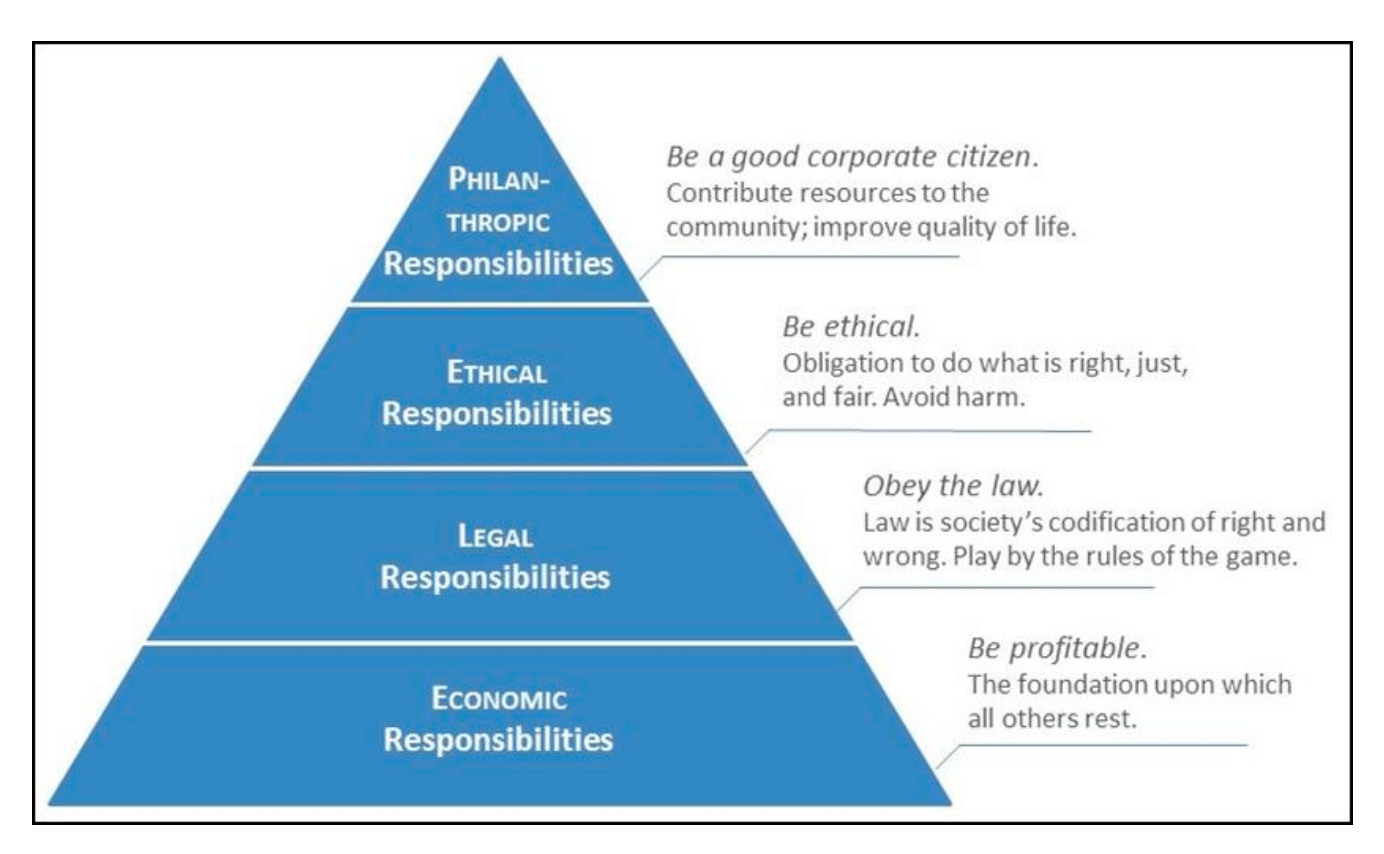
Figure 2. Carroll's Pyramid.

In this rapidly developing group of related ideas, Carroll took economist Milton Friedman's idea of responsibility: "conforming to their basic rules of the society, both those embodied in law and those embodied in ethical custom" of a society [27] by identifying the basic rules embodied in ethical custom and provided useful framework: "economic, legal, ethical and discretionary" [28]. His pioneering framework for categorising and prioritising values and obligations can be seen in Figure 2 below. Managers were able to sort through competing claims and agendas to make decisions using Carroll's framework. It helped them considering and evaluate CSR claims and it was useful for scholars and others trying to analyse business—society relations generally.