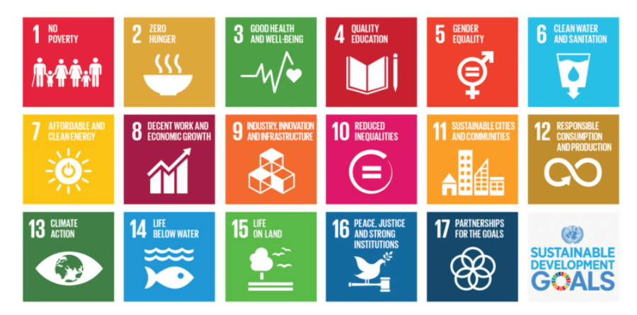
Figure 1. List of the 17 Sustainable Development Goals (SDGs).

move to this second phase. This process allowed us to deepen the analysis. Thus, in the second phase, after another process of inter-judge negotiation, 19 projects were discarded (31.15% of the initial works).