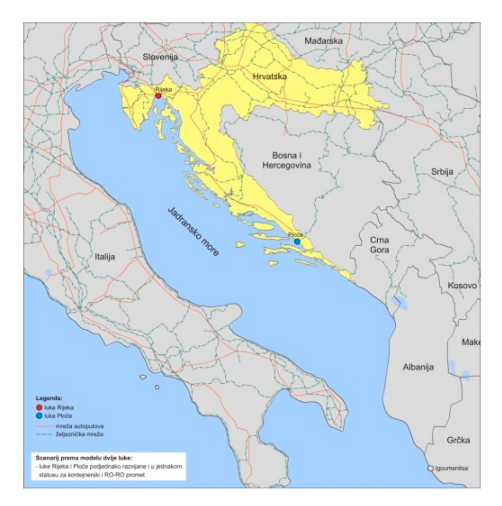
Figure 1. Model of implementation of a sustainable Motorways of the Sea through two ports in the Republic of Croatia.

In the case of a simultaneous influence of the infrastructural and administrative-political criteria groups, or the influence of the infrastructural criteria group only, the model of a single port is greatly advantageous because the condition of the conjoined traffic infrastructure, as well as of the means of manipulation in the terminal of the port of Ploče, is at a very low level. When the road infrastructure, which is currently under construction, allows for an undisturbed connection to the highway network and the railroad infrastructure is brought to a level of regular functioning, the model of a single port will not be dominant anymore, leaving space to the model of two ports, which will be preferable.