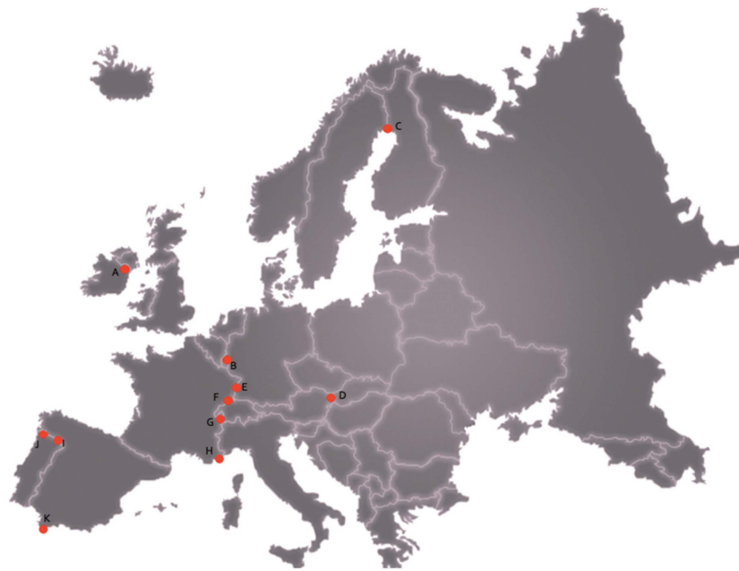
Figure 2. Selected case studies (Author). (A) Newry–Dundalk; (B) Aachen–Liège; (C) Haparanda–Tornio; (D) Vienna–Bratislava; (E) Strasbourg–Kehl; (F) Saint Louis–Basel; (G) Geneva–Annemasse; (H) Nice–Monaco; (I) Chaves–Verín; (J) Tuy–Valença; (K) La Línea de la Concepción–Gibraltar.