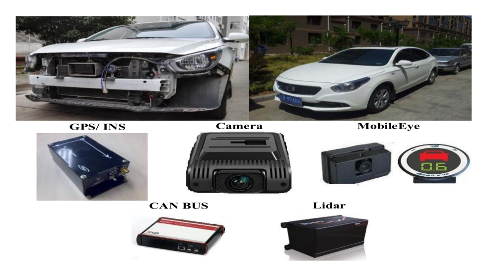
Figure 3. Experimental vehicle and equipment.

The experiments were conducted using the Trump chi GA3 vehicle model manufactured by the Trump chi vehicle company. The vehicle was outfitted with different equipment to collect comprehensive data related to driving behavior and the environmental conditions. The vehicle equipment is shown in Figure 3.