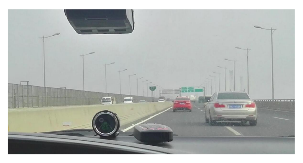
Figure 2. A photograph of the experimental vehicle, equipment, and surroundings.

To collect near-crash data from naturalistic driving, experiments were undertaken using an instrumented vehicle on different road types in the city of Wuhan. During the experiments, each participant was informed to maintain his or her regular driving style as much as possible. In addition, to ensure that the experiments were standardized and conducted in similar conditions, the participants were asked to drive on the same routes using the same instrumented vehicle during the same periods. Experiments were conducted in September, October, and December 2016. Figure 2 shows the view from the test vehicle and its equipment and surroundings during the naturalistic driving experiment.