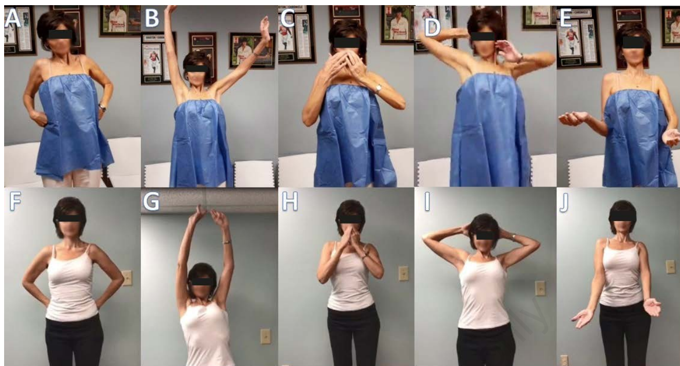
Figure 1. A series of images of a 46-year-old woman with obstetric brachial plexus injury. Follows pre- (upper panel) and postoperative movement (lower panel), 4 months after mod Quad surgery. Upper panel: (A) limited hand to spine movement; (B) limited ability to raise arms above head; (C) difficulty in hand to mouth movement; (D) difficulty in placing hands to the neck; (E) supination with an angled forearm. Lower panel: (F, G, H, I, J) Postoperative images of same patient 4 months after mod Quad surgery relating to same movement as that directly above it. Total Mallet score increased significantly from 15 to 21. Her hand to neck movement increased significantly, from Mallet score 2 to 4.