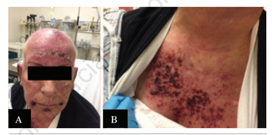
Figure 1. Images of the patient's skin rash and crusting lesions; A) periorbital edema and forehead skin breakdown; B) characteristic anterior chest wall (V sign) rash.

to a five-fold increase in the rate of mortality when edema is a feature of the disease.7 This patient's observed angioedema and laryngeal edema were consistent with symptomatology reported in previous cases of EDM requiring intubation.6 The prolonged hospital course involving ICU level of care experienced by this patient is further evidence that EDM should be considered as a more severe form of DM, in which early and aggressive intervention may be beneficial. In support of the growing number of cases of EDM, efforts are underway to elucidate the underlying mechanism behind this dramatic third spacing. Recent hypotheses as to the causative process include elevated VEGF expression,8 increased vascular permeability in an inflammatory state,9 and elevated serum type I interferon.6 However, none of these hypotheses have sufficient data delineating differences in the underlying pathogenesis that would distin-