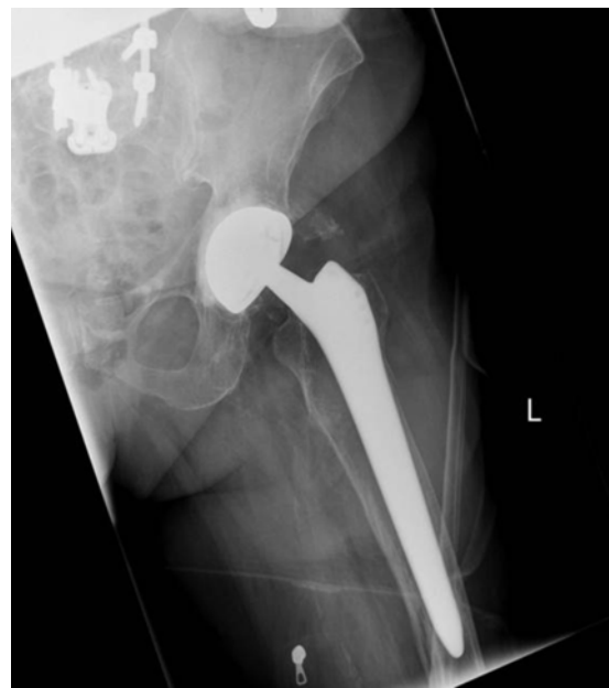
Figure 4. Axial X-ray imaging of Figure 3.