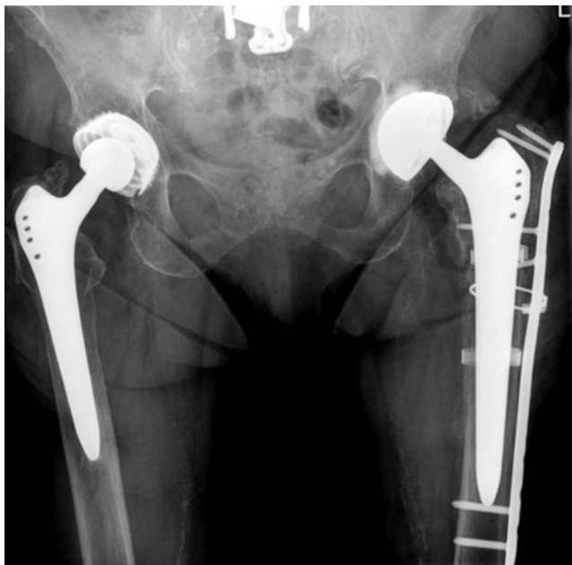
Figure 5. Postoperative X-ray image after open reduction and internal fixation using cerclage cables and plate (proximal).