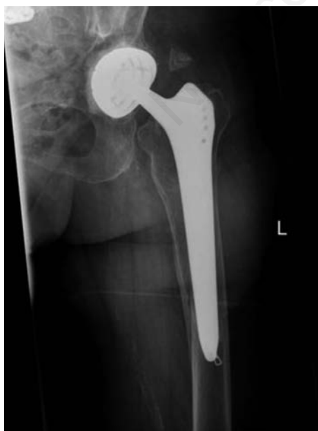
Figure 3. Preoperative X-ray image of periprosthetic femoral fracture Vancouver type B (a.p.).