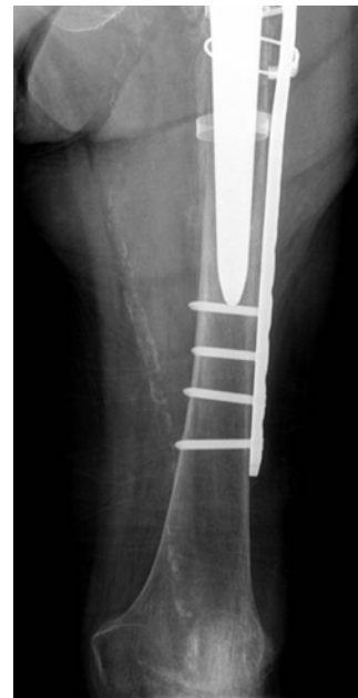
Figure 6. Postoperative X-ray image after open reduction and internal fixation using cerclage cables and plate (distal).

categorized ASA 4. One of these patients, aged 78 years, died one day postoperatively, and the other 86-year old patient deceased on the third day postoperatively.