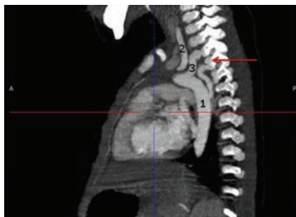
Figure 2. Angio-magnetic resonance imaging: abnormal dilated serpiginous vascular structure (red arrow) originating from the descending aorta with intraforaminal extension. 1: Descending aorta; 2: left vertebral artery; 3: subclavian artery.