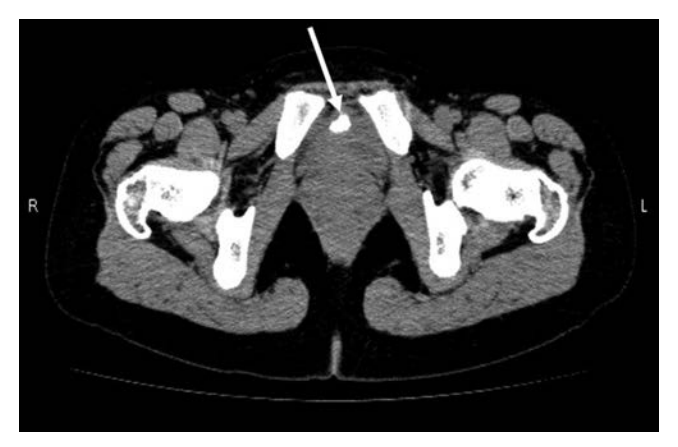
Figure 2. Computed tomography after injection of contrast medium from the prepubic sinus. White arrow indicates the sinus continuing near the anterior area of the bladder.

means that treatment of CPS is not necessarily required in all cases.