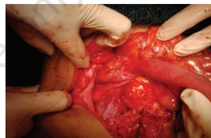
Figure 1. Intraoperative image showing hepatic flexure in the midline.

©Copyright P. Chaudhary et al. , 2012 Licensee PAGEPress, Italy Clinics and Practice 2012; 2:e78 doi:10.4081/cp.2012.e78