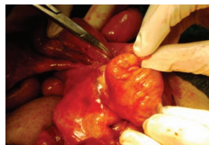
Figure 2. Pointer showing intussusception.