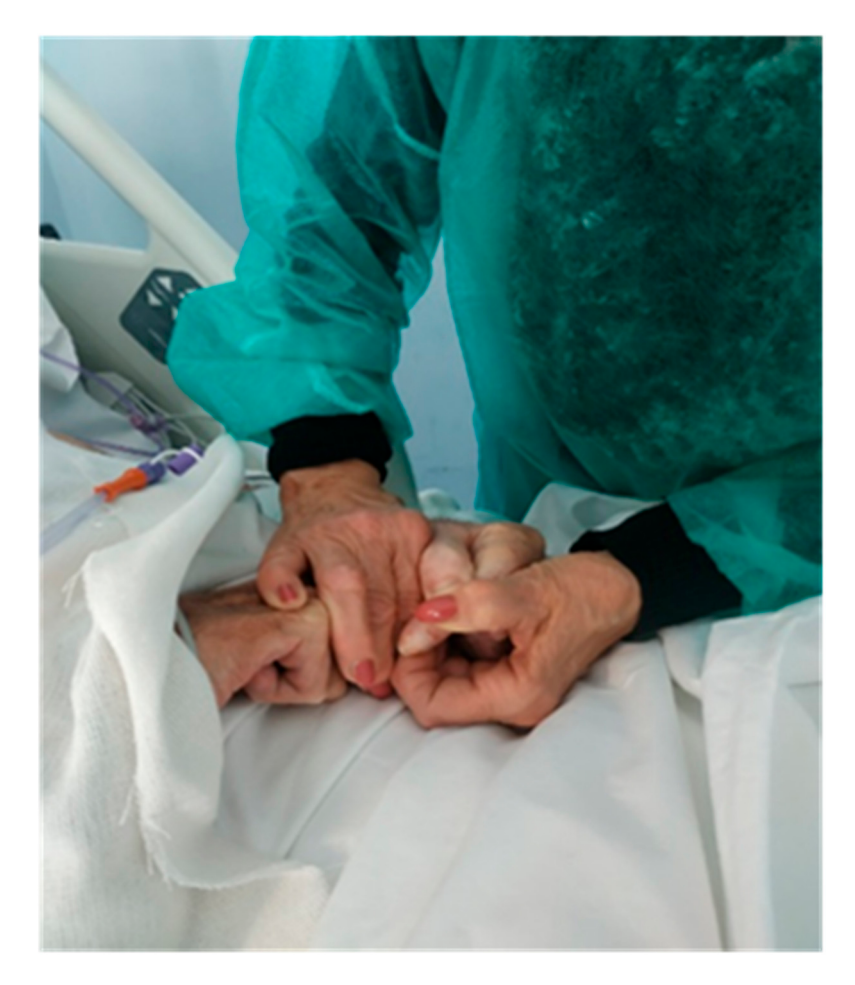
Figure 1. The figure shows the importance of "emotional touch" according to the HIM.

The enrolled ABI people's caregivers, as well as their loved ones, participated in the HIM, consisting of real and long-lasting physical and emotional interaction without any separating space in a dedicated hospital room during the Omicron wave (Figure 1).