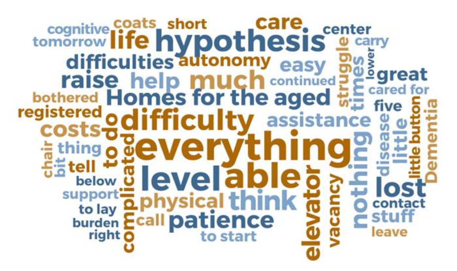
Figure 1. Word cloud. Difficulties in carrying out care by Portuguese caregivers. Via QSR NVivo<sup>®</sup>.

The word clouds (Figures 1 and 2) illustrate the main difficulties reported by caregivers, highlighting mainly work overload, lack of support and resistance of the older adults to care.