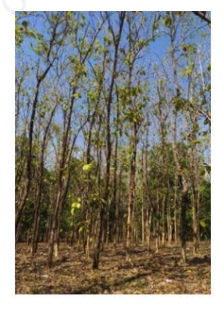
Figure 1. Teak Plantations in Makassar Campus of Hasanuddin University.

(Table 1). At this research location the