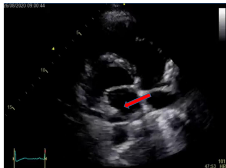
Figure 1. Transesophageal echocardiogram (TEE) showing large tricuspid vegetation on mid-esophageal four-chamber view (arrow showing tricuspid vegetation).

As the diagnosis of probable endocarditis was established, transthoracic echocardiography (TEE) was performed and showed no vegetation on any of the heart valves. Consequently, an indication for transesophageal ultrasonography was established, and the result of this examination showed a floating vegetation, sized 3 × 11 mm, on the anterior leaflet of the tricuspid valve with significant tricuspid regurgitation (3+). There were no signs of vegetation in the mitral, aortic, or pulmonary valve (Figure 1).