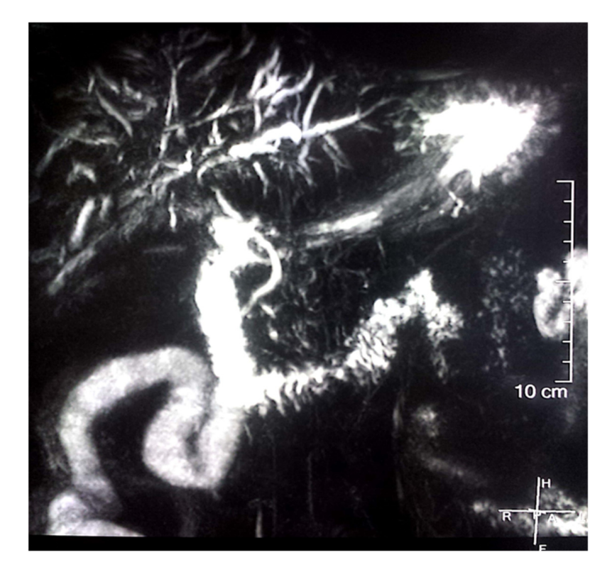
Figure 1. Abdominal magnetic resonance imaging (MRI): segmental strictures of intrahepatic bile ducts especially in the left liver lobe and of the wirsung duct. The extrahepatic bile duct was not dilated.

On the basis of these findings, we have discussed other differential diagnosis, including malignancies (pancreatic head cancer and bile duct carcinoma) and inflammatory disorders namely primary sclerosing cholangitis. However, auto-immune disorder with pancreaticobiliary involvement related to IgG4 disease were also suspected.