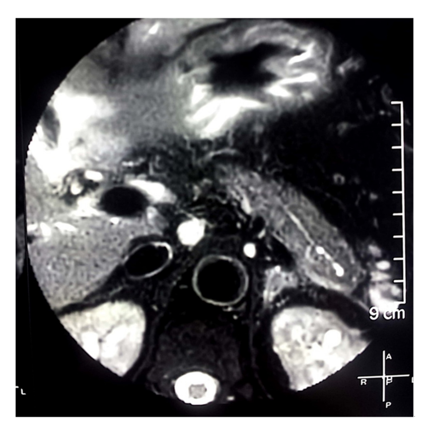
Figure 2. Abdominal magnetic resonance imaging (MRI): Segmental strictures in wirsung's duct, an increased volume of the pancreas especially in the head, and loss of physiological lobular appearance.