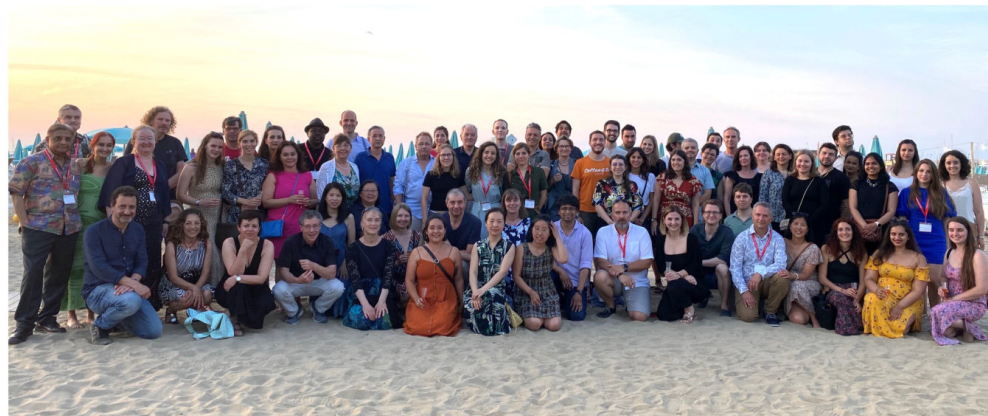
Figure 1. Rimini, 17 June 2022: relax on the beach (courtesy of Maria Söderlund-Venermo).

The closing event, a very informal dinner directly on the beach in Rimini (Figure 1), followed by wild dancing until dawn as in the best tradition, provided the link to the next XIX Parvovirus Workshop, which is to be held in Leuven, Belgium, from 3 to 6 September 2024, hosted by Els Henckaerts. Please visit: parvovirusworkshop2024.org .