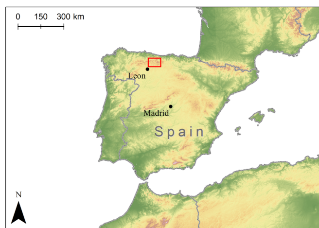
Figure 1. Location of the forest area in the Cantabrian Mountains (North Spain), in which seeds of beech trees were sampled (rectangle).

Fagus sylvatica seeds were collected across seven forest sites on north-facing slopes in the Cantabrian Mountains (NW Spain; Figure 1) in autumn 2009 (distances between sampling sites were 3–50 km; for forest site characteristics see Table S1 and Dziedek et al. [31]).