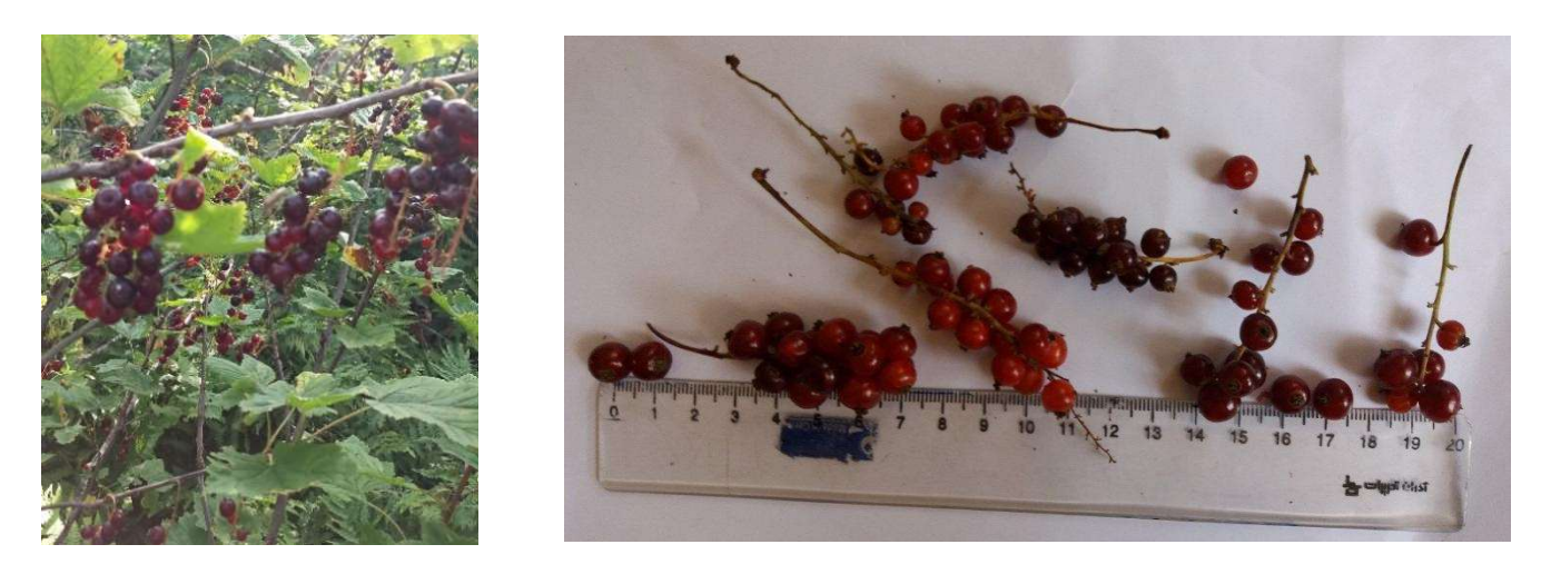
Figure 3. Fruit and leaves of the reddish blackberry (Ribes biebersteinii) in Arasbaran forests.

Reddish blackberry is native to Arasbaran forests, and people harvest its fruit between July and August (Figure 3). In traditional medicine, this fruit is used for curing blood pressure issues. While some households reported selling reddish blackberries fresh, none reported that they consume the fruit fresh. The mean annual household income in the Kalasur village derived from the sale of reddish blackberry was 142 USD. The total annual household income in Kalasur village was about 5714 USD in 2019. The share of reddish black berry in total annual household income was about 2.5%. One of the most important issues reported in harvesting forest products, especially fruit, is the cost of processing the fruit in order to increase their added value or shelf life. Fruits are cleaned and dried for consumption and sale by storing them in the shade before allowing them to be dried in the sun. After drying, the fruits typically lose about 80% of their weight. Our research found that the processed fruit of the reddish blackberry was about five times more valuable than the raw fruit. Dried fruits are usually consumed by making tea.