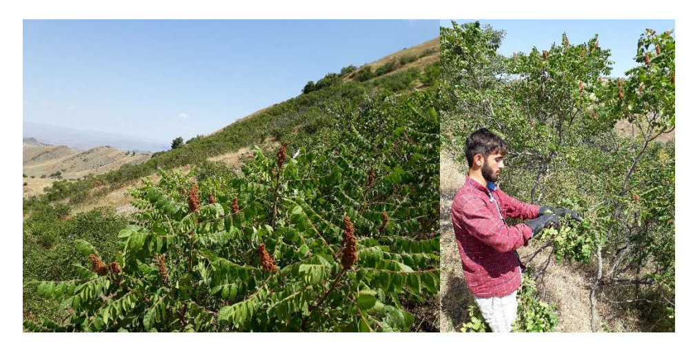
Figure 2. Sumac trees and fruit harvesting by local people in Arasbaran forests.

Sumac, a shrub species used in the agroforestry system of the study site, grows to 3-4 m in height. The main location of households engaged in sumac harvesting was in the Eastern part of Arasbaran forests, Hurand County, Iran (Figure 2). Almost all households interviewed were intensively involved in sumac harvesting. These households' samples were different from the category of households surveyed in food forest products in Section 3.1 (as explained in the methods section). The amount of sumac harvested annually ranged from 144 kg per household in Mollalu to 776 kg per household in Tabestanagh. Three villages, Rahimbayglu, Vurujan Sofla, and Tabestanagh, started planting sumac on sloping lands in 2001. In these three villages, people know well the importance of sumac in their household incomes. The village of Mollalu started planting sumac later (in 2006) because of a delay in the provision of extension services and governmental support. The contribution of sumac income to total household income is indicative of rural people's dependence on this product. The mean annual sumac income in the sample rural household income was 1822 USD (range = 550–2958 USD) (Table 2). In all villages, except Mollalu, sumac harvests contributed 30-40% of total household income. In Mollalu, where livestock is the most important income source, sumac contributed to only 10% of total income (Table 2).