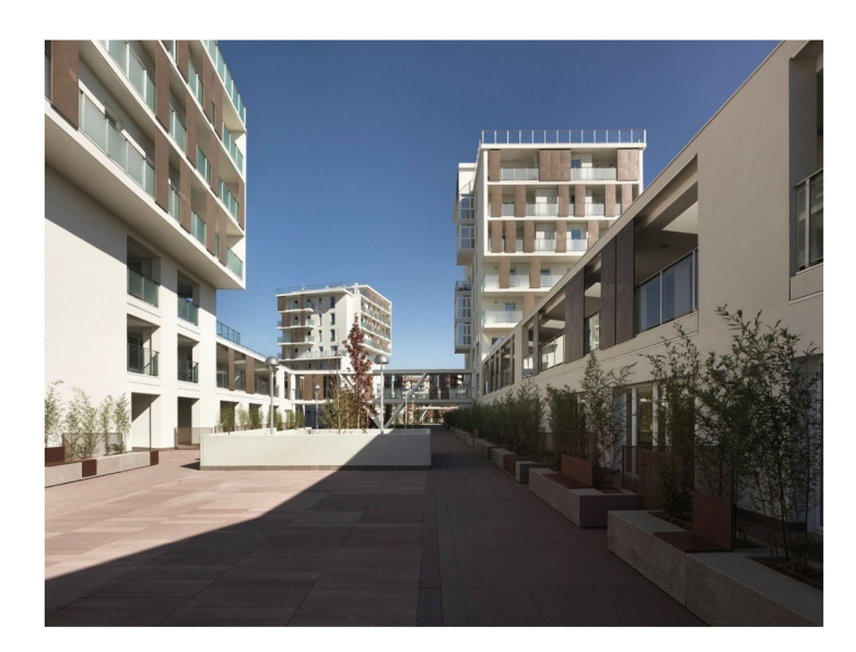
Figure 4. Via Cenni social housing complex in Milan, Photograph by Pietro Savorelli [49].

several two-storey linear buildings, both built on the top of a concrete basement and an underground car park.