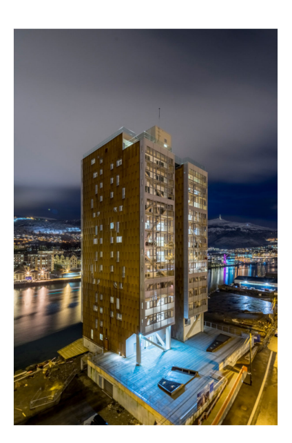
Figure 5. Treet—timber tower apartment building in Bergen, Photograph by David Valideby [52].

The 14-storey timber tower apartment building Treet ("tree" in Norwegian) designed by architectural office Artec shown in Figure 5, whose glulam truss structure draws its inspiration from contemporary bridge design, was completed in 2015 in Bergen, Norway [48] and was recognised as the tallest timber building of that time.