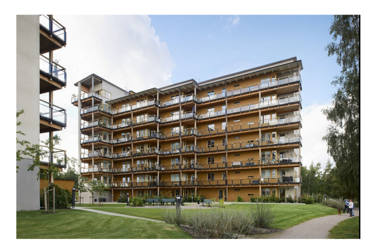
Figure 3. One of the four Limnologen buildings, Photograph by Åke E:son Lindman [47].

space heating was 12 kWh/m²a, 35 kWh/m²a for water heating, and 39 kWh/m²a for household electricity. The measured values showed higher consumption for the energy demand for heating, which amounted to 37 kWh/m²a in 2013. Although not reaching the passive house standard with regard to the climate of Växjö, the buildings can be rated as energy efficient. There are some data available on the environmental performance of the Limnologen buildings [46], but, due to the methodology of the environmental statement, they are not sufficient to make a comparison with other selected buildings.