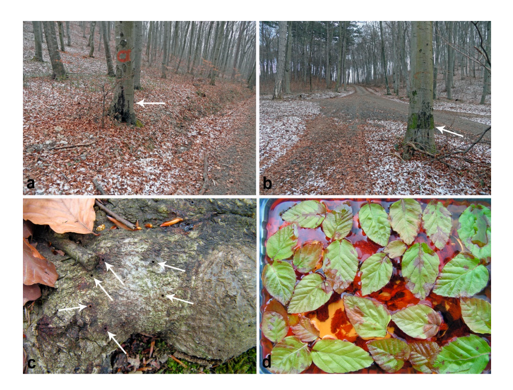
Figure 3. (a,b) Bleeding collar rot lesions caused by Phytophthora × cambivora on Fagus sylvatica trees along forest roads in stand F15 Haspelwald 2; (c) surface root of a beech tree in stand F16 Hengstlberg with exit holes of the bark beetle Taphrorychus bicolor being mostly connected to the bleeding bark lesions caused by P. × cambivora ; (d) baiting test from an inactive aerial canker of a beech tree in stand F17 Hocheck 2 with lesions on F. sylvatica baiting leaves caused by P. plurivora .