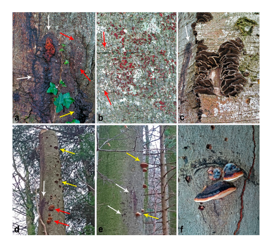
Figure 5. Secondary fungal bark infections on Fagus sylvatica trees infected by Phytophthora spp. in Lower Austria: (a) bleeding collar rot lesion (white arrows) caused by P. ×cambivora in stand F16 Hengstlberg with secondary infection by Cylindrocarpon sp./ Neonectria sp. (red arrows); (b) white pycnidia of C. candidum (red arrows) and red perithecia of N. coccinea in stand F16 Hengstlberg; (c) bleeding collar rot lesion (white arrow) caused by P. ×cambivora in stand F12 Hadersfeld 2 with fruiting bodies of Bjerkandera adusta ; (d,e) aerial bleeding cankers (white arrows) caused by P. cactorum in stand F06 Sommerein with fruiting bodies of the secondary invaders Oudemansiella mucida (red arrows) and Fomes fomentarius (yellow arrows); (f) fruiting bodies of the secondary invader Fomitopsis pinicola above a collar rot lesion caused by P. ×cambivora (not shown) on a beech tree in stand F04 Purkersdorf.

In 21 of the 34 beech stands, a total of 21 fungal species were recorded on various types of bark damages and on dead wood (Table S5 (Supplementary Materials)). In 19 stands, 18 fungal species were associated with collar rot cankers, in many cases as secondary invaders of lesions where a Phytophthora species was isolated from the active lesion margins (Figure 5). With 12 stands, Armillaria spp. which were not identified to the species level, were most common, followed by Fomes fomentarius (10 stands), Trametes spp. and Hypoxylon sp. (each eight stands), Schizophyllum commune (six stands) and Ustulina deusta (four stands). Other aggressive secondary bark pathogens like Bjerkandera adusta and Neonectria sp./ Cylindrocarpon sp. were more rare (Table S5 (Supplementary Materials)); Figure 5). Eight of the 19 fungal invaders of primary Phytophthora collar rot lesions were also colonizing mechanical injuries on buttroots and stems (Table S5 (Supplementary Materials)). In three stands, F. fomentarius , Inonotus nidus-pici , Oudemansiella mucida and Polyporus squamosus were secondary invaders of aerial Phytophthora bark cankers. Neonectria ditissima was locally widespread in the stands in Hohenegg, causing in twigs, branches and in rare cases, also stems, typical perennial cankers which were not related to primary Phytophthora infections. The wood decay fungus S. commune was typically associated with sunburn injuries in five stands.