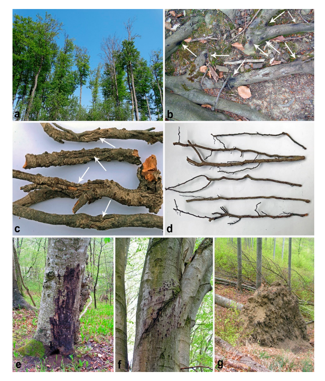
Figure 2. Decline and dieback symptoms caused by Phytophthora spp. on Fagus sylvatica in Lower Austria; (a) severe dieback, chlorosis and mortality due to root and collar rot caused by Phytophthora × cambivora in stand F01 Hadersfeld 1; (b) bleeding bark lesions caused by P. × cambivora on surface roots in stand F16 Hengstlberg; (c) coarse roots of wind-thrown beech trees in stand F16 Hengstlberg, with severe losses of lateral roots and open callusing lesions caused by P. × cambivora ; (d) small woody roots with extensive losses of lateral roots and fine roots caused by P. plurivora and P. syringae in stand F03 Kaisersteinbruch; (e) bleeding collar rot lesion caused by P. ×cambivora in stand F34 Wienerwaldsee; (f) aerial bleeding canker caused by P. plurivora in stand F19 Hohenegg 2; (g) wind-thrown beech trees in stand F16 Hengstlberg due to severe root losses and root lesions caused by P. ×cambivora .