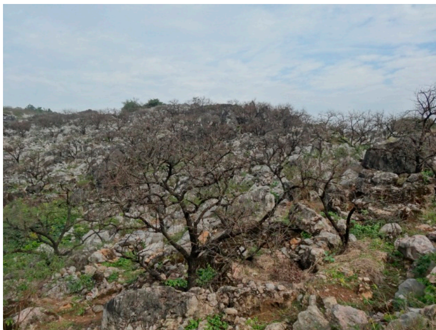
Figure S1. Rocky desertification in the study area.