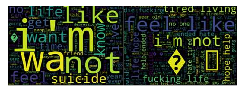
Figure 3. Suicide Ideation Detection Framework.