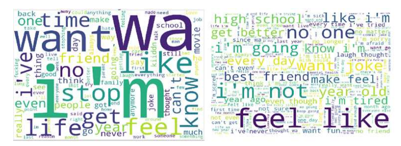
Figure 4. Non-Suicide Ideation Detection Framework.

Another interesting observation is found in users' depiction of suicidal tendencies. It is mostly expressed by the words with death connotations ("suicide", "want die", "die fucking", "suicide wish", "wish die", "want kill", "want end", "want go"). Furthermore, sense of urgency and a manifestation of hopelessness is also visible ("hope help", "life hope", "help ended").