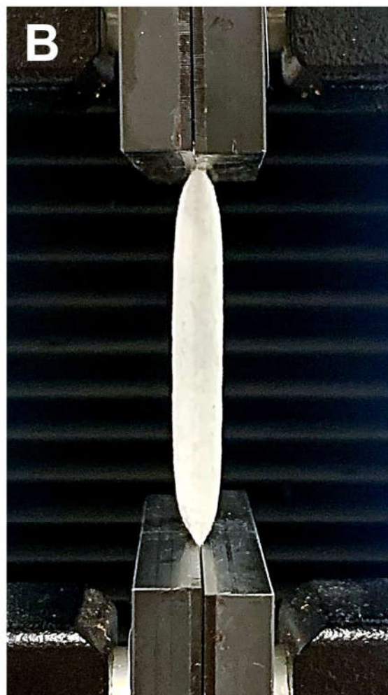
Figure S1. Set up of grips for mechanical testing: (A) Circumferential Tensile Test. (B) Uniaxial Tensile Test.