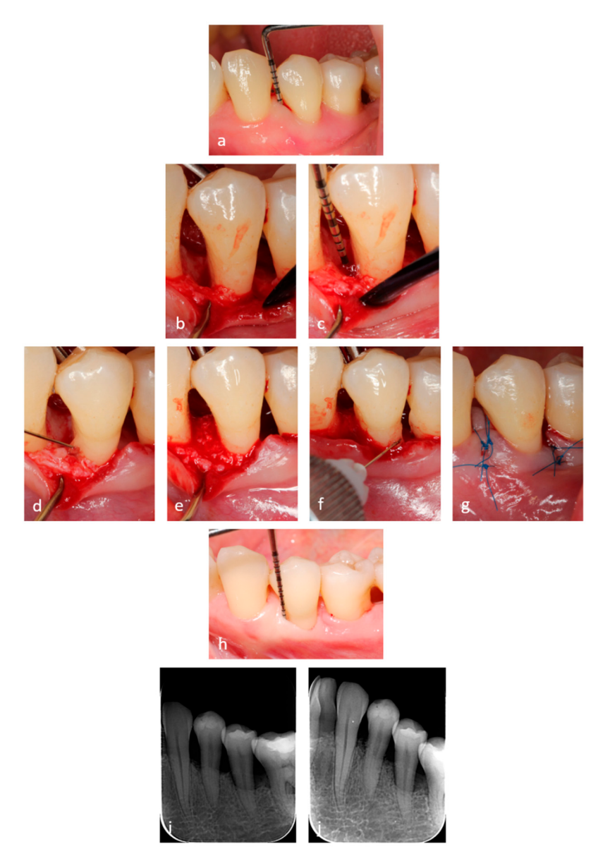
Figure 2. (a) Preoperative view and PPD depth of 8 mm. (b,c) Clinical intraoperative view of the defect with a 7mm depth of the intrabony component. (d) Clinical view of the instrumented root surface with a thin layer of HA applied. (e) Mixture of HA and xenograft gently packed in the intrabony defect. (f) HA layer applied before suturing on the surgical area. (g) Passive primary wound closure. (h) PPD of 2 mm at 6 months. (i) Pre-operative radiographic finding. (j) Radiographic finding at 6 months.