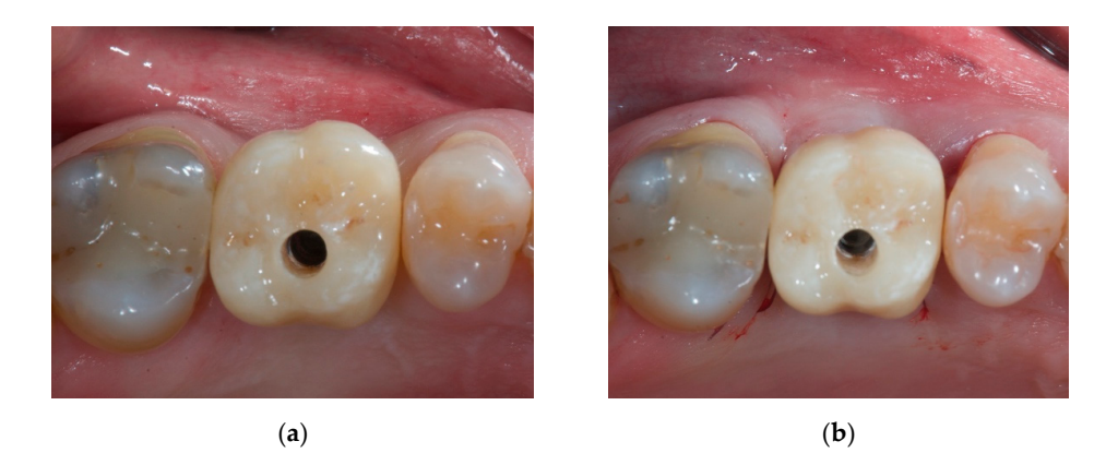
Figure 4. Occlusal view of the surgical site and the temporary screw-retained crown highlighting the volumetric differences between pre-augmentation (a) and post-augmentation (b) in the immediate post-operative period.

Once the CM was placed inside the envelope, the suture (6-0 polyglycolic acid) had the only role of repositioning the mesial and distal papilla apically according to the augmented buccal volume. The temporary resin crown was finally screwed to the implant in order to sustain the volumetric increase of the soft tissues (Figure 4a,b).