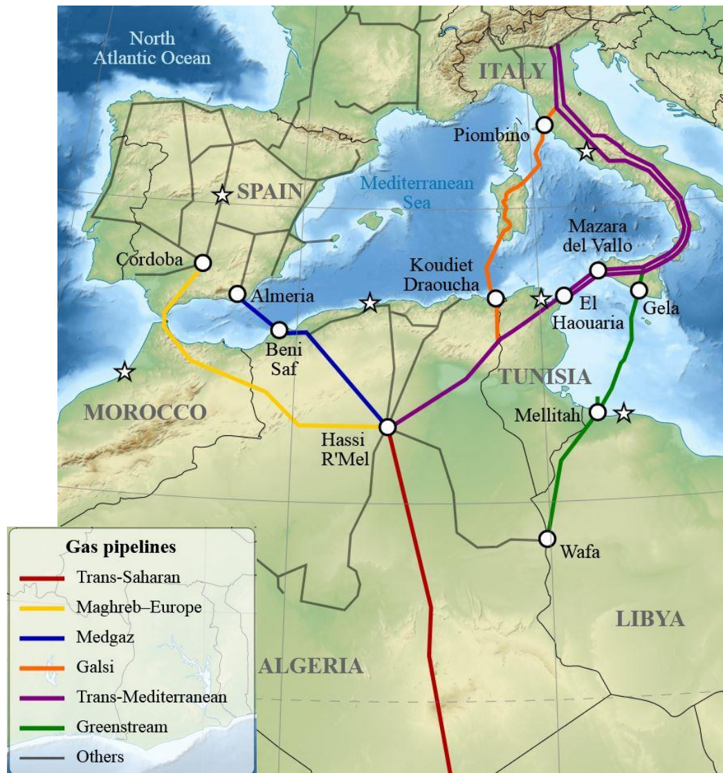
Figure S3. Route of the Algerian-Italian gas pipeline through Sicily.