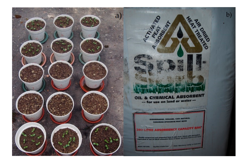
Figure 2. (a) Experimental set up. Picture taken at the end of the study (153 days); (b) bioremediation treatment, Spill-Sorb.

On 24 October 2018, soil was sampled from the contaminated area. On the same day, soil samples were also collected nearby that were not affected by the oil spill (control). The main focus was to conduct experiments and soil analysis in a controlled area to observe the effect of the bioremediation treatments. For this purpose, two days later, an experiment was set up in triplicate in the greenhouse of the University of Zagreb Faculty of Agriculture (Figure 2a). The sub-samples for soil chemical analysis were taken at the beginning of the experiment (2 days) and then after 10, 50, and 153 days.